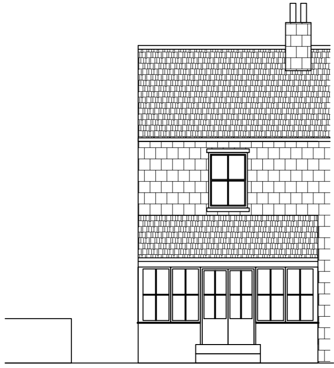
EXISTING REAR ELEVATION SCALE 1:100 AT A3