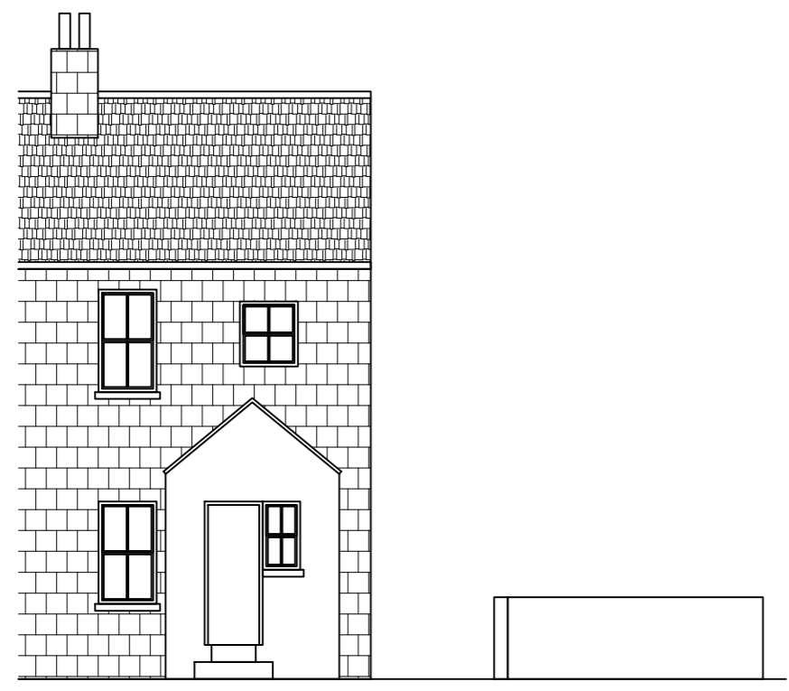
EXISTING FRONT ELEVATION SCALE 1:100 AT A3