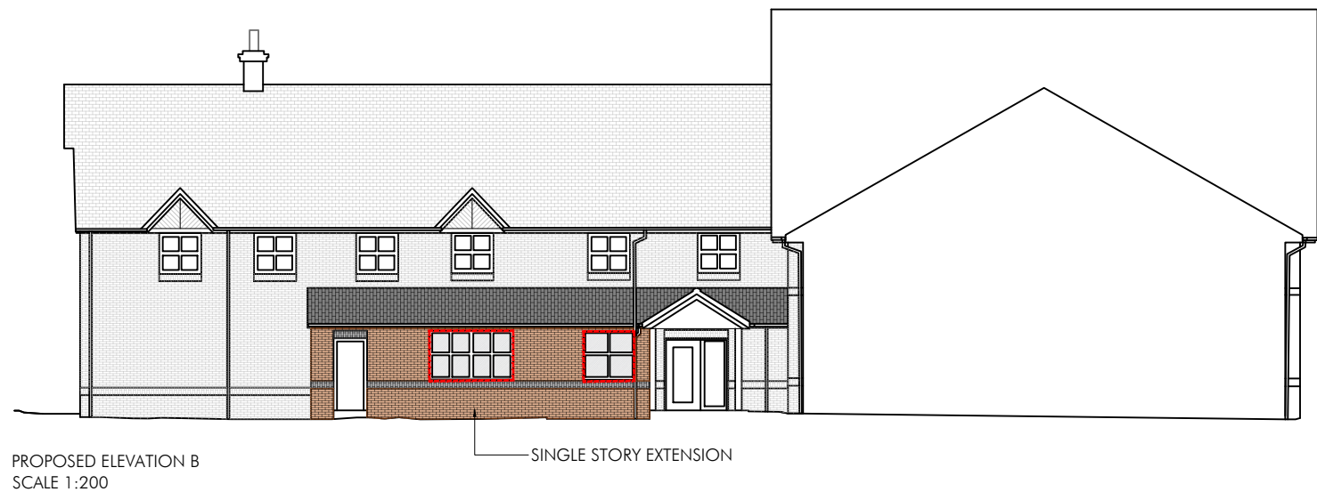
PROPOSED ELEVATION B SCALE 1:200

0 2m 4m 6m 8m 10m 20m SCALE 1:200 IN METRES