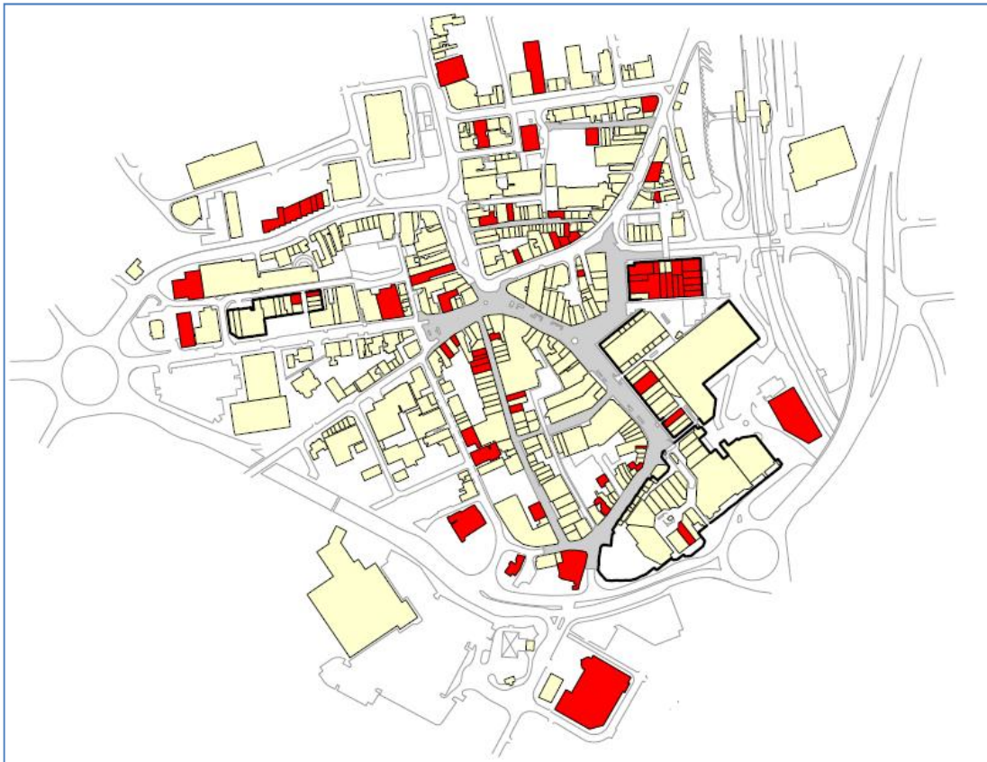
Figure 5.2: Town centre vacant units based on a Goad Plan surveyed on 19 May 2014

5.8 The vacancy rate is around 3 percentage points above the national average, at 14.9% compared with 11.32% nationally. The proportion exceeds the national average, largely due to a cluster of empty units around the markets, left vacant in anticipation of redevelopment. Excluding this cluster area, which is an inevitable consequence (rather than an indicator of poor vitality and viability) in the lead up to complicated town centre redevelopment, the vacancy rate across the centre as a whole is not unusually high, with vacancies dispersed with many in predominantly non-retail or secondary shopping areas of the town centre which are, by their nature and definition, marginal and/or unsuitable for retail use. The plan below shows the location of the vacancies at the time the centre was surveyed: