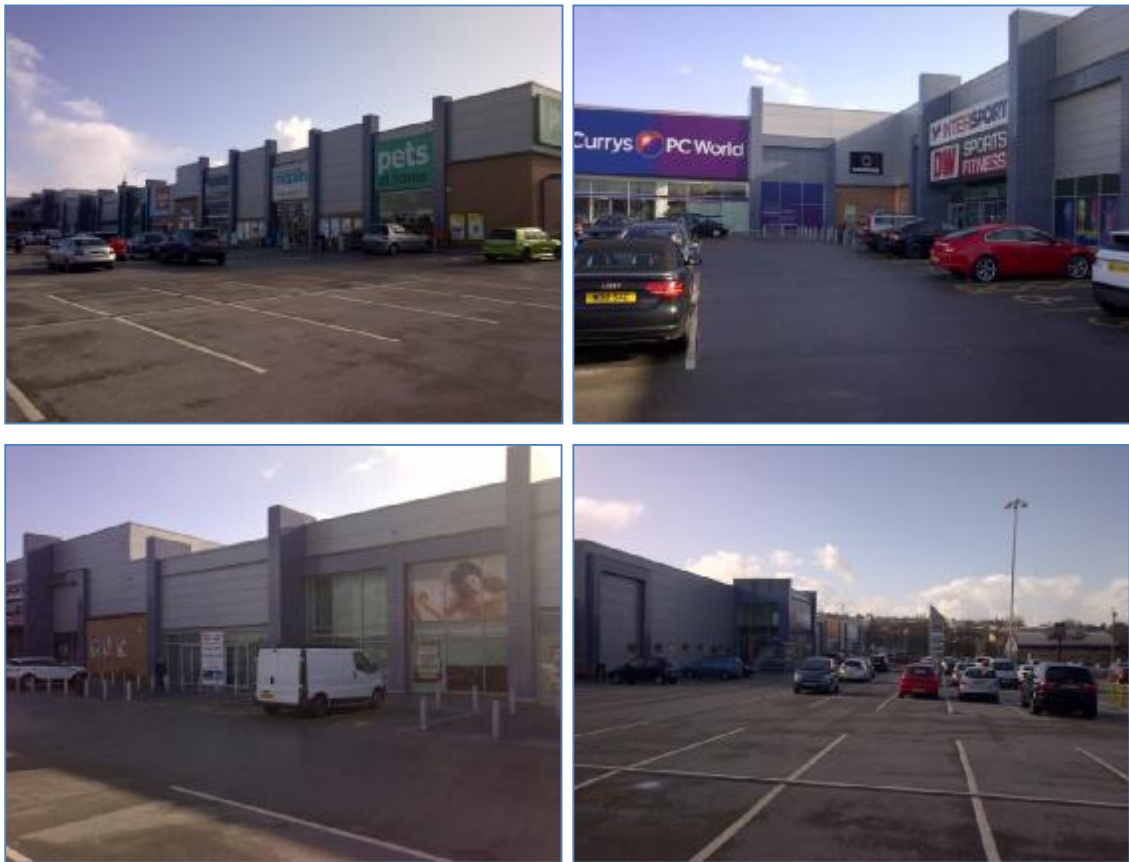
Figure 2.2: Site photographs