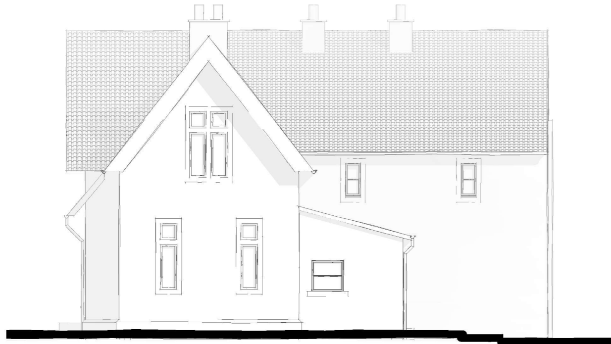
East Existing Scale 1 : 100