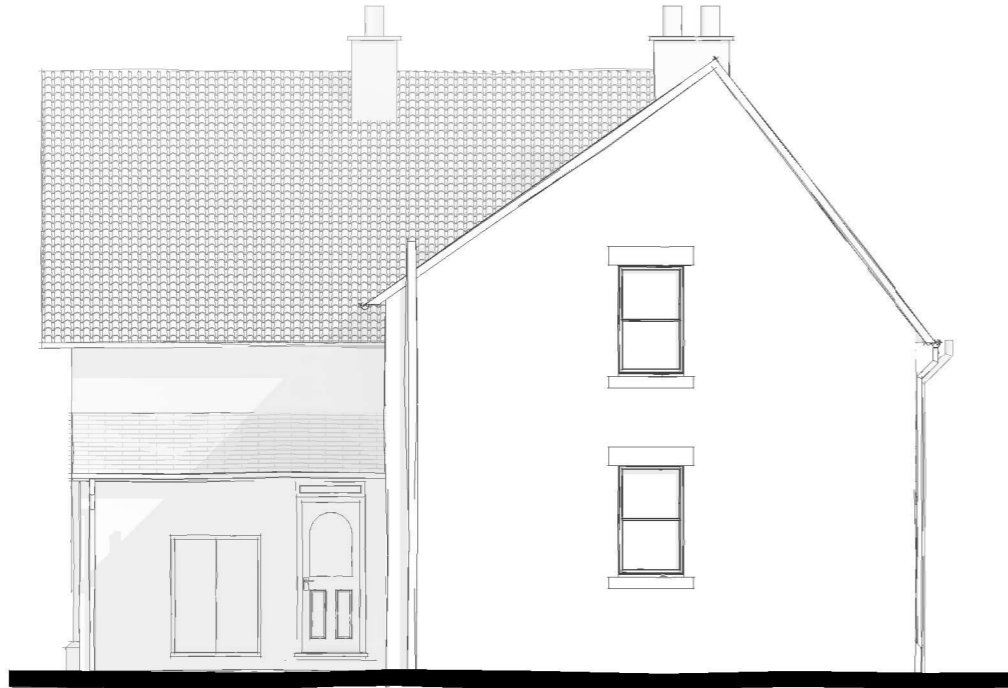
North Existing Scale 1 : 100

This drawing is the copyright and remains the property of Charrette Architecture Ltd and must not be reproduced in whole or in part without their written permission. Do not scale from this drawing. Refer to printed dimensions only. All dimensions are to be checked by using site measurements and discrepancies reported to the designers. This drawing must be read in conjunction with all other Consultants and Subcontractors drawings, together with any written specifications and relevant contract documents