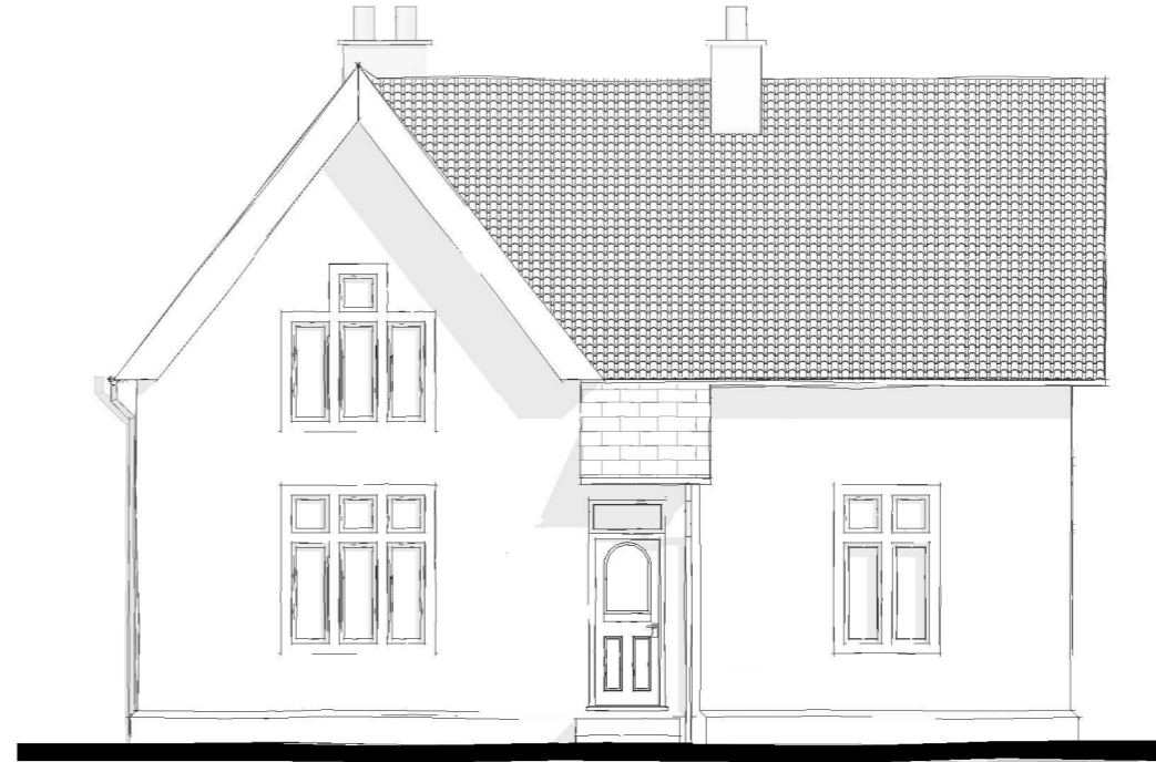
South Existing Scale 1 : 100