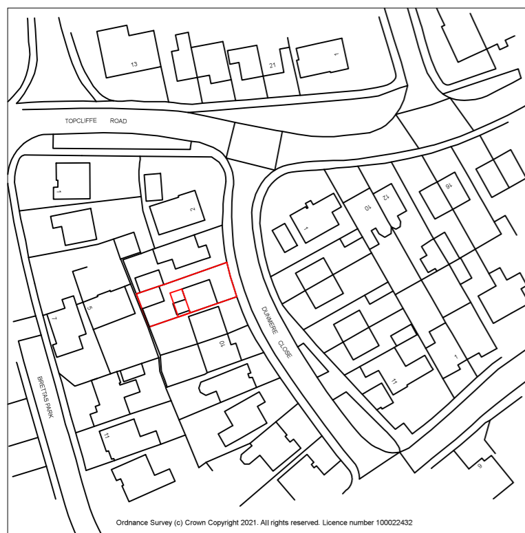
LOCATION PLAN SCALE 1:1250 AT A3