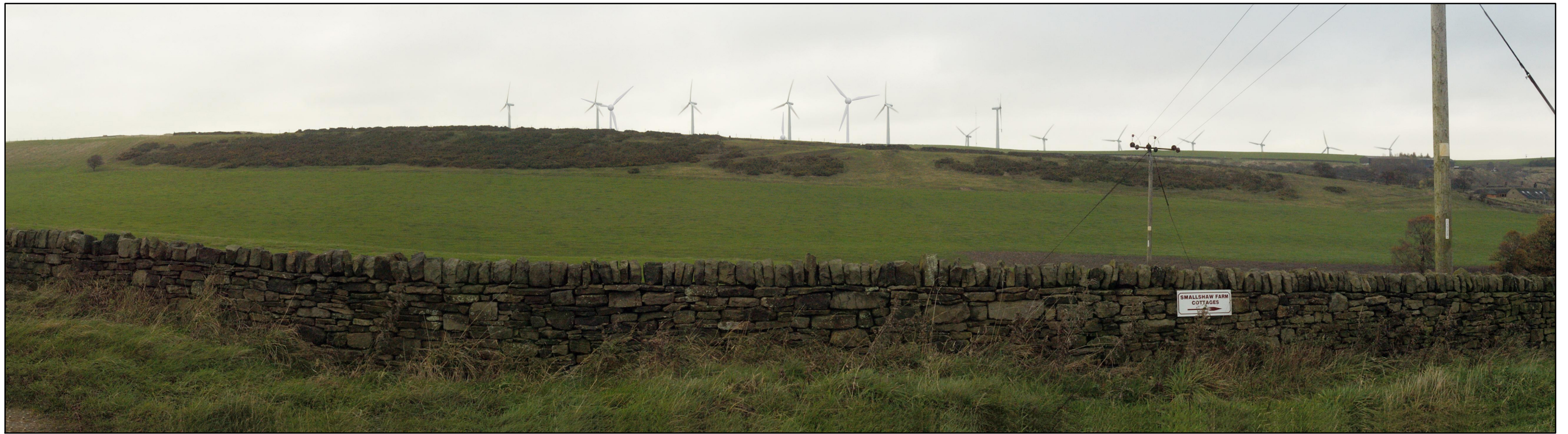
Photomontage showing proposed development from viewpoint