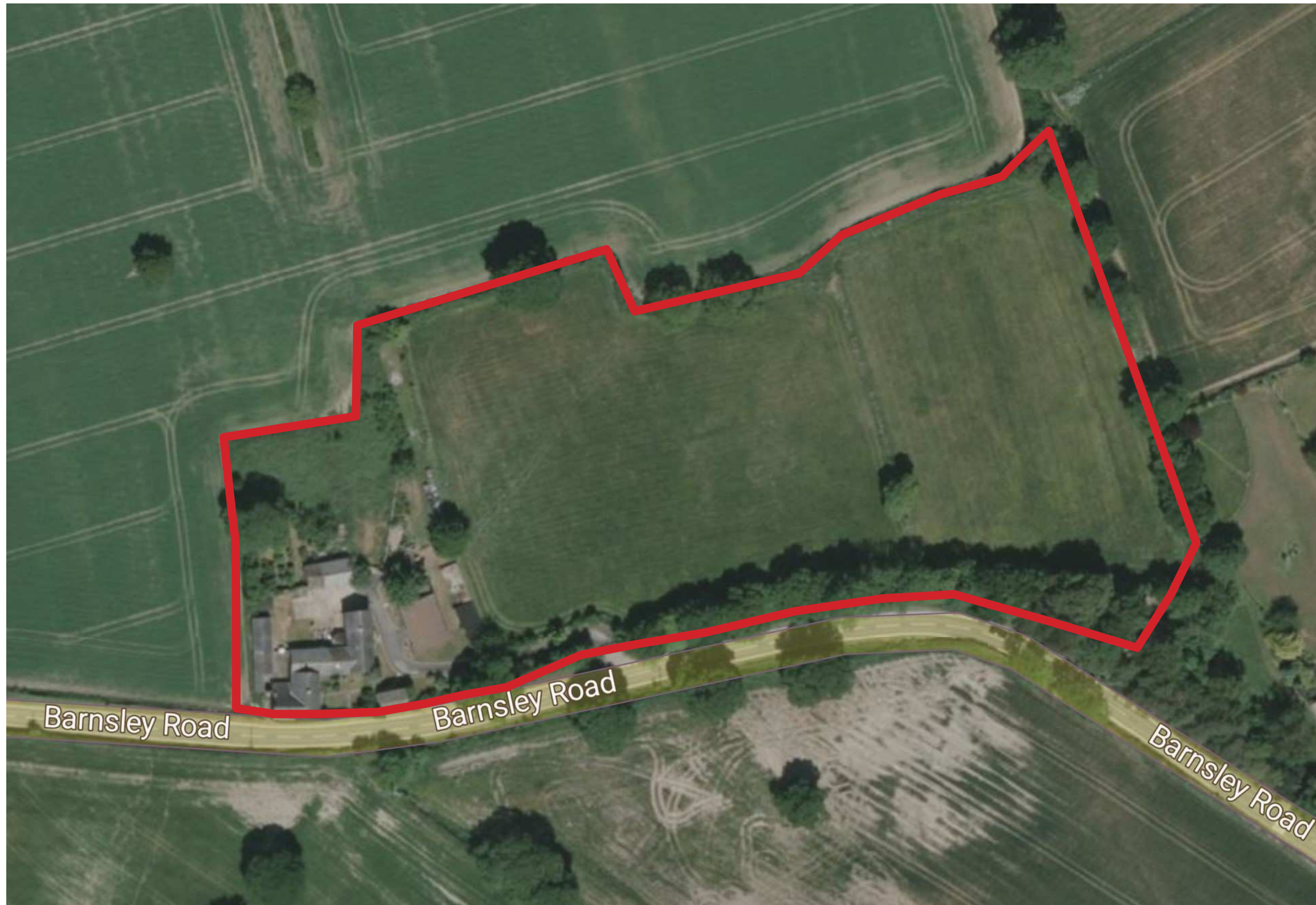
Hollin Royd Farm Cawthorne