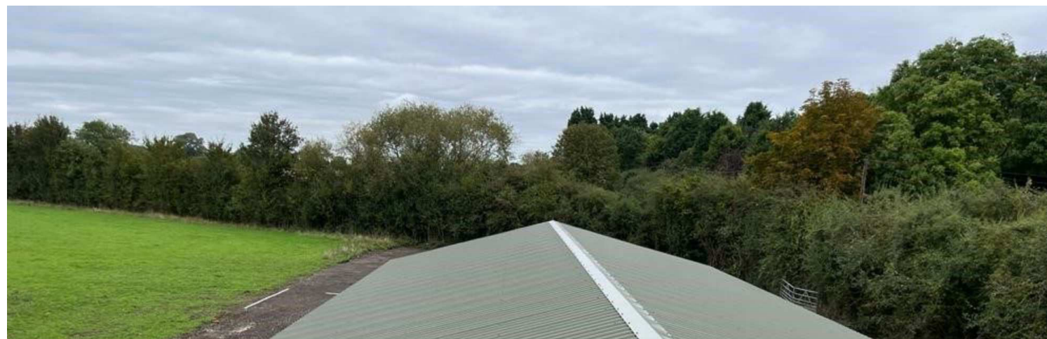
Hollin Royd Farm Cawthorne