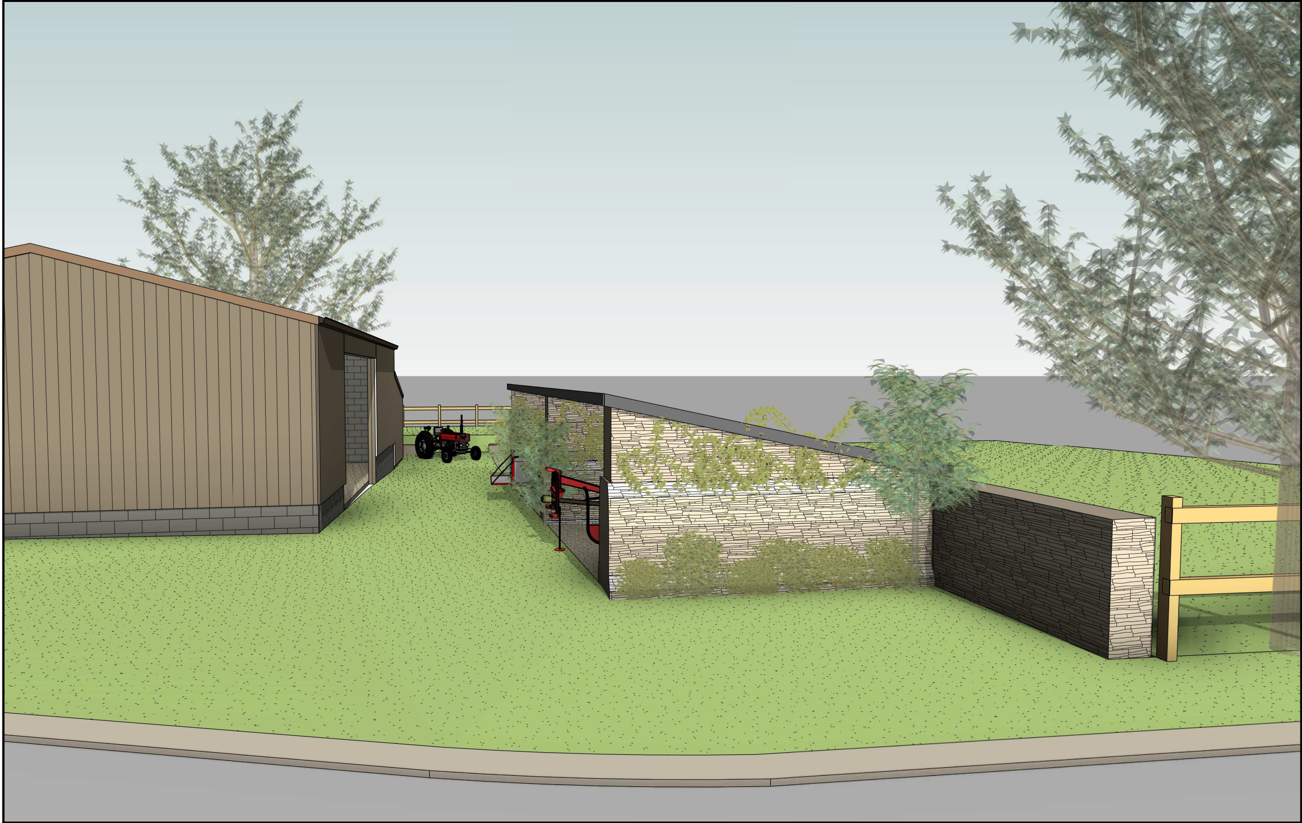
Hollin Royd Farm Cawthorne