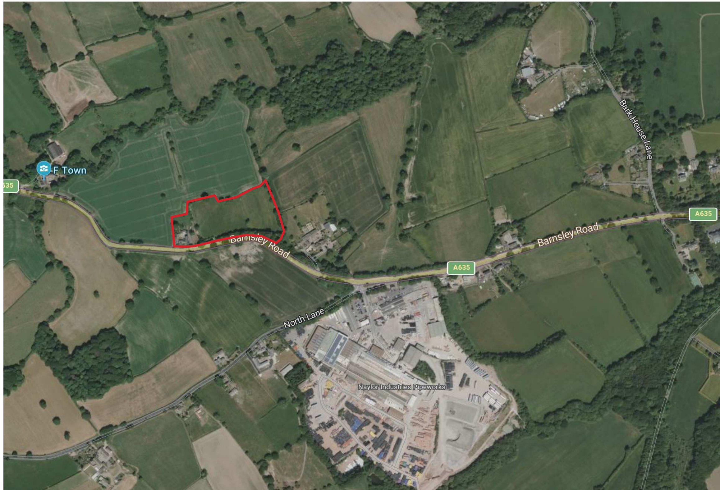
Hollin Royd Farm Cawthorne