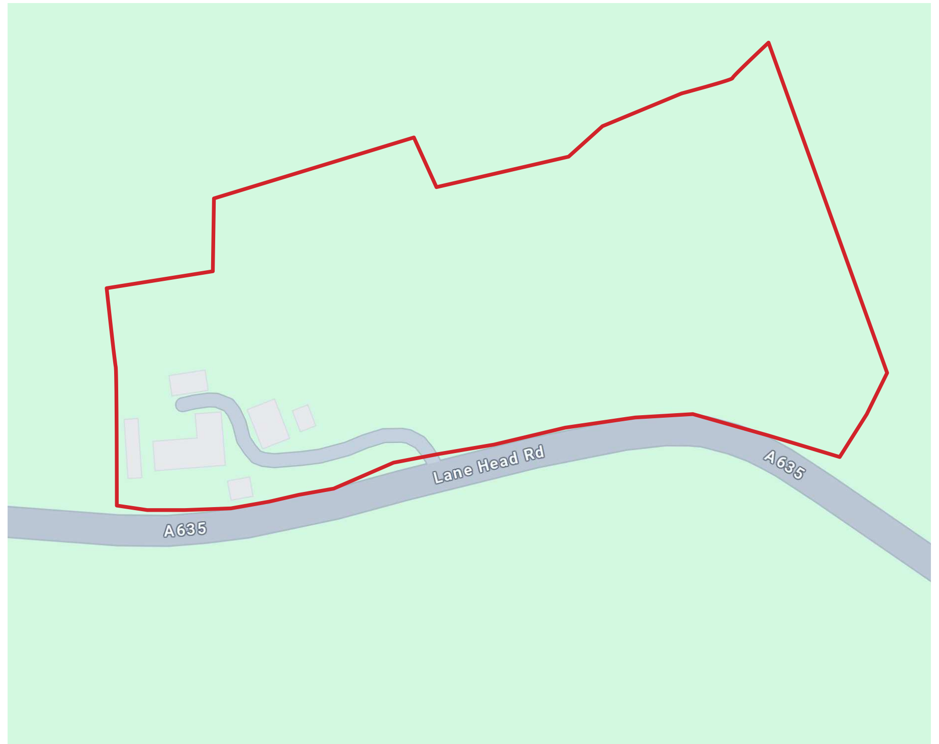
Hollin Royd Farm Cawthorne