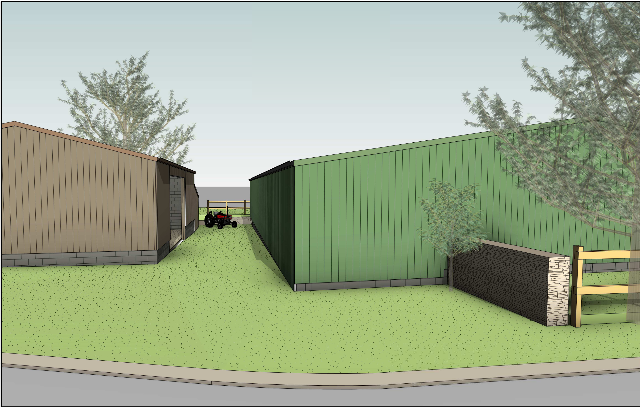
Rear 3D View