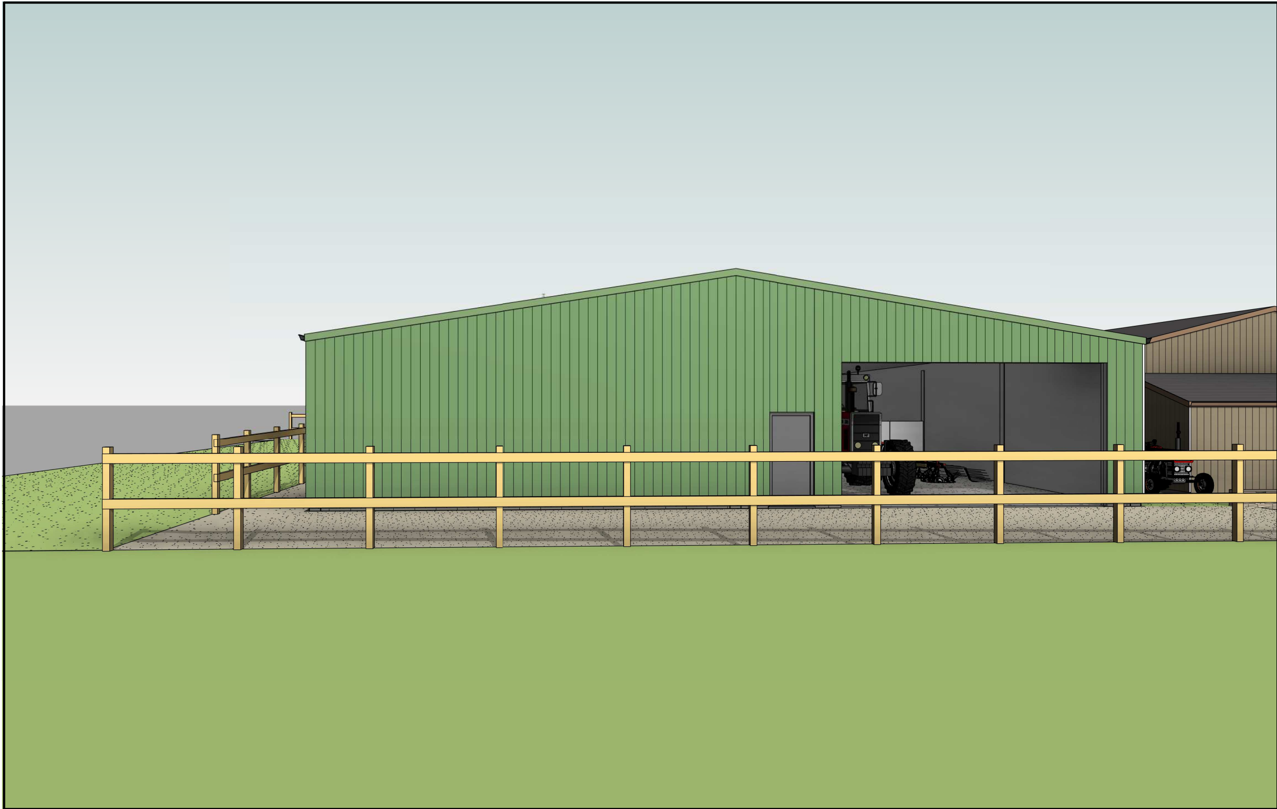
Front 3D View