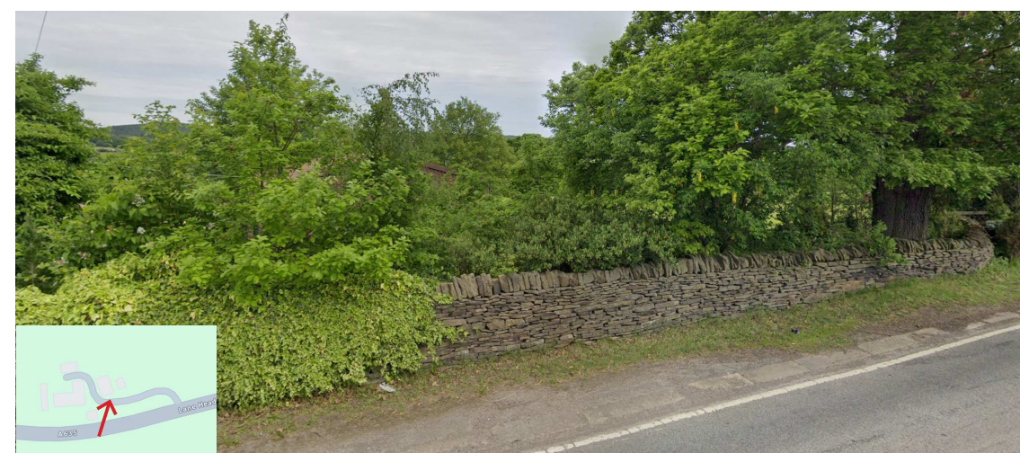
Existing shed and adjacent box profile building as viewed from main road