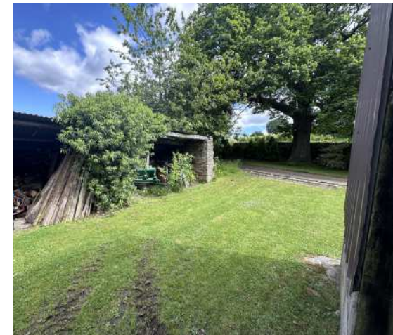
Hollin Royd Farm Cawthorne