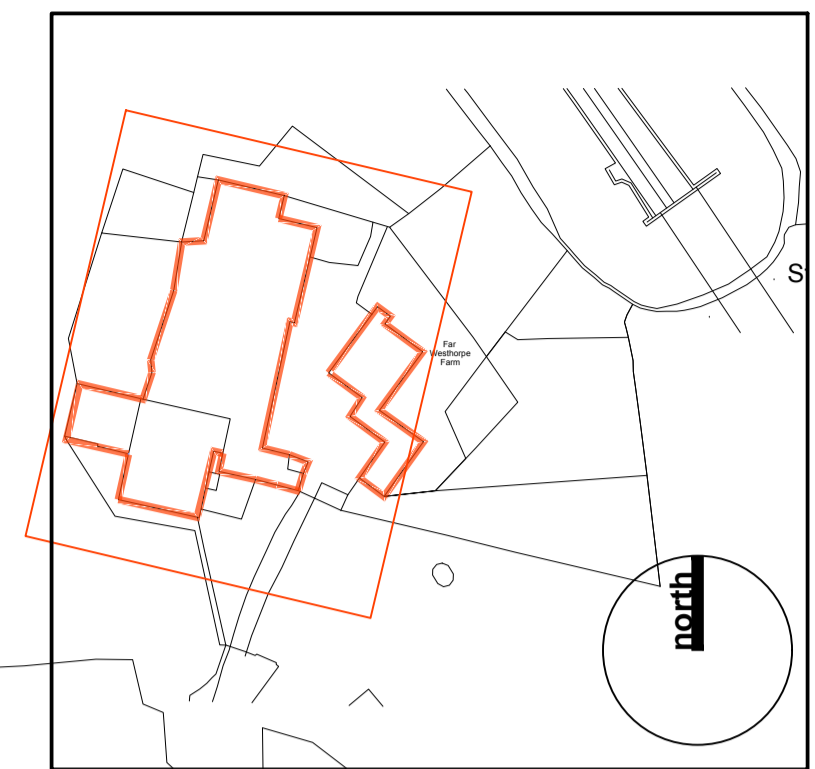
Key Plan 1:1250