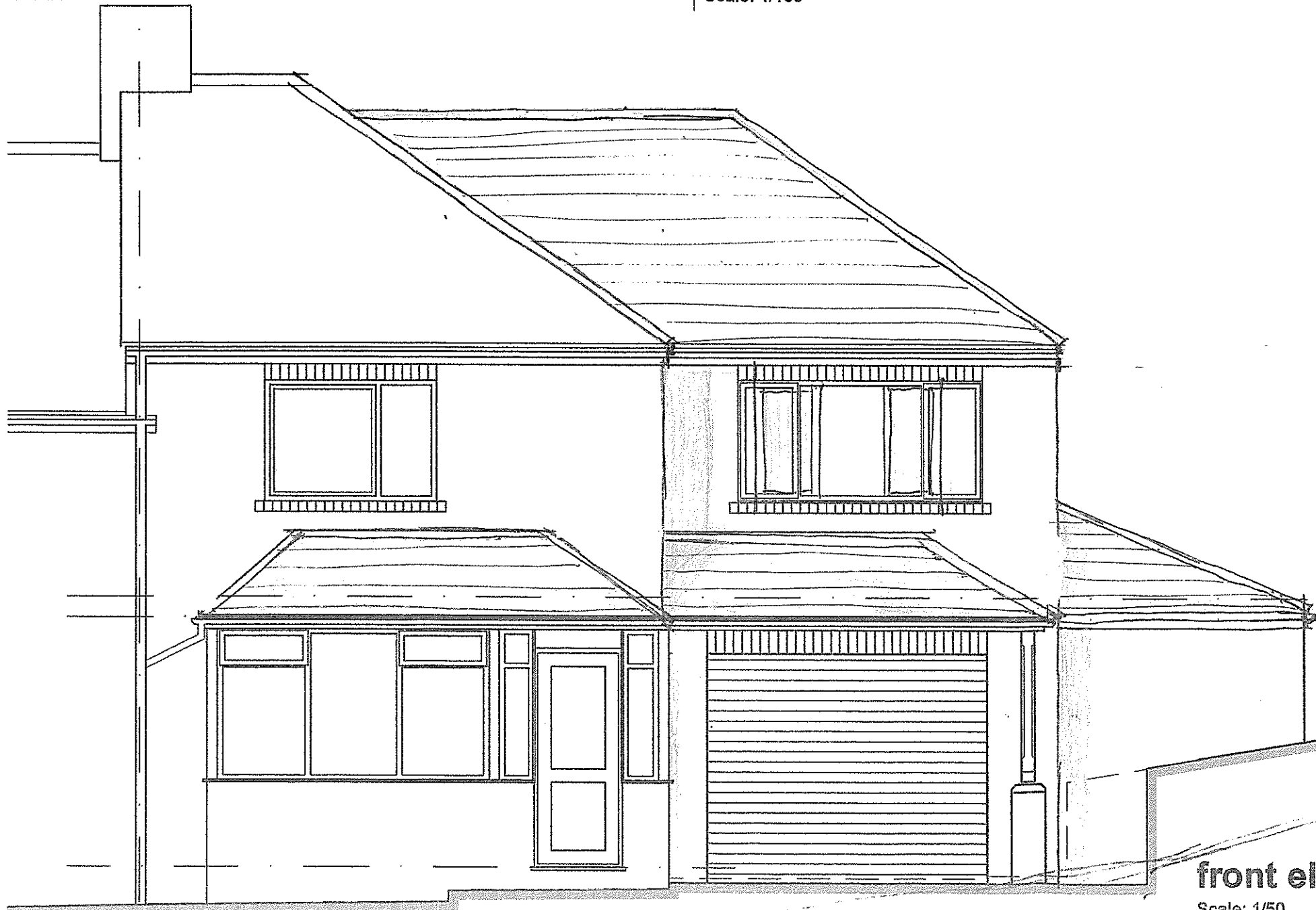
front elevation Scale: 1/50