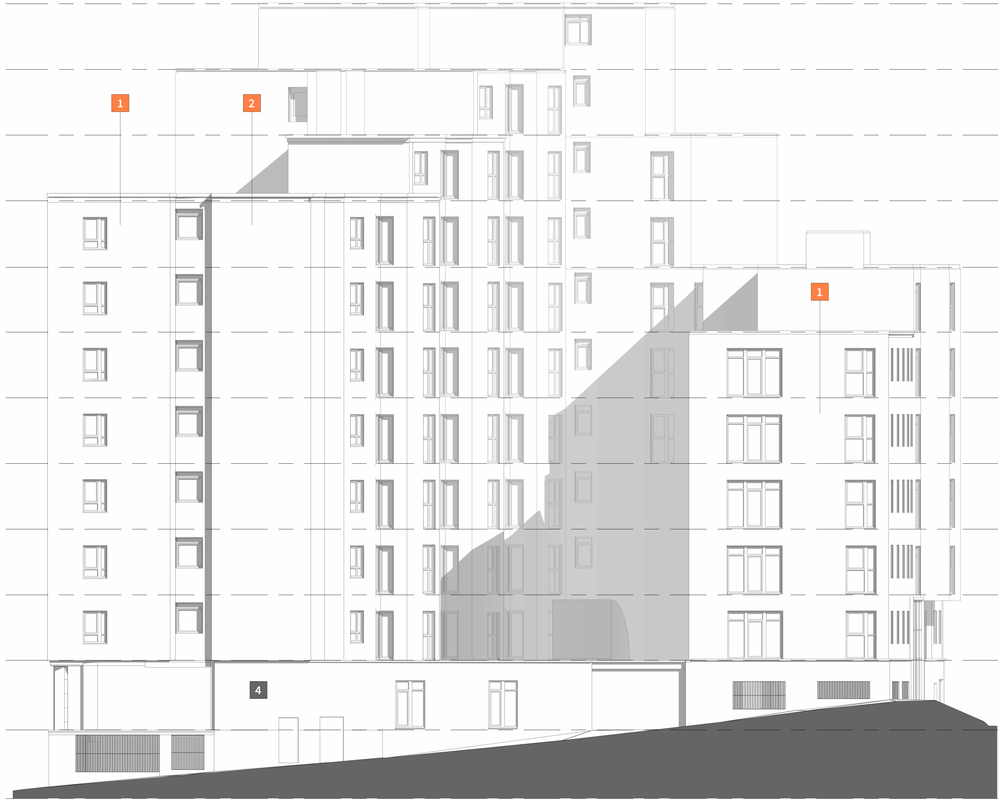
1 Proposed_Elevation - John-St 1:100