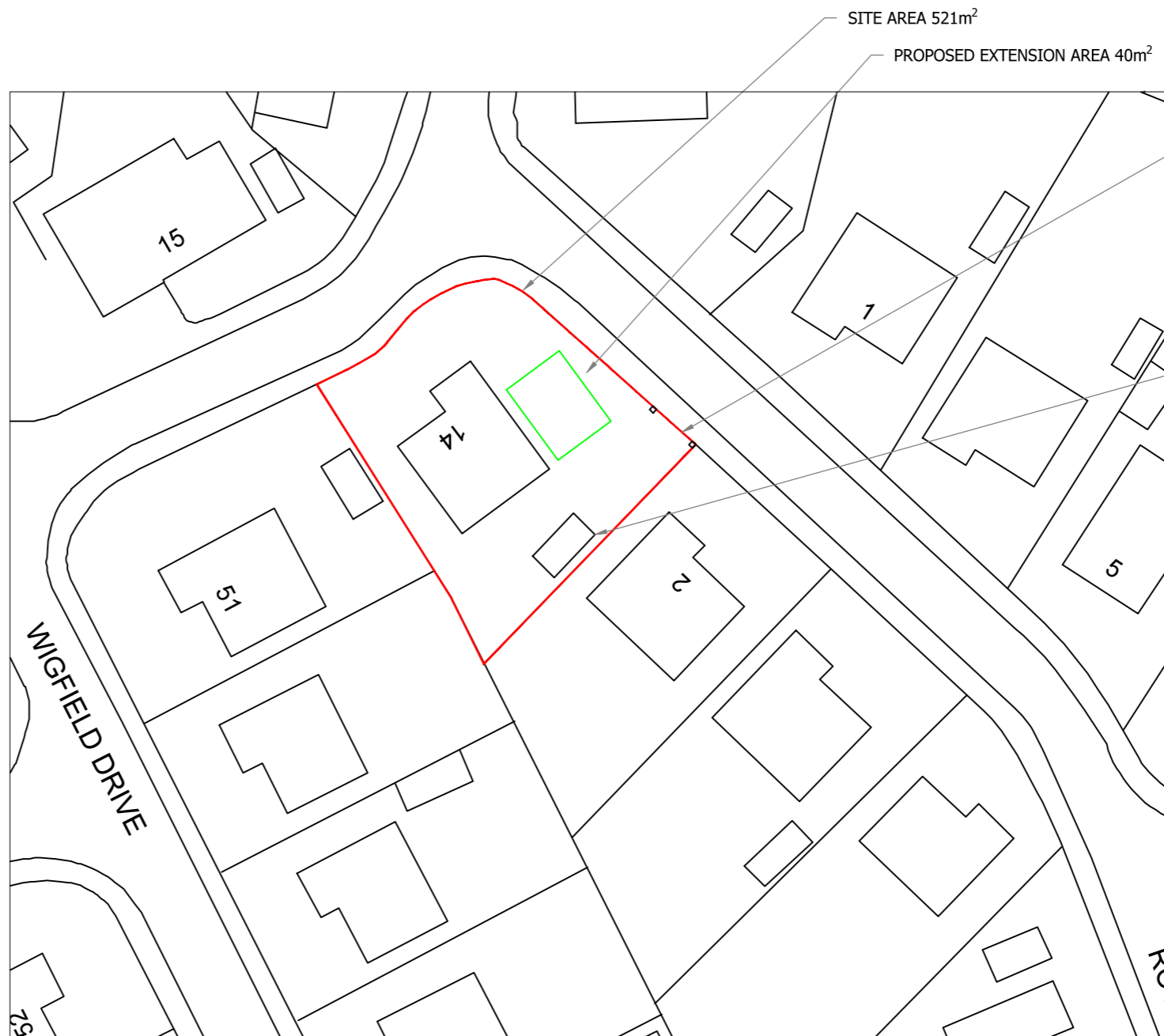
SITE PLAN SCALE 1:500 AT A3