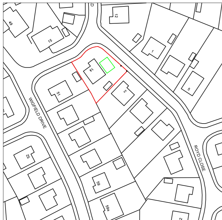
LOCATION PLAN SCALE 1:1250 AT A3