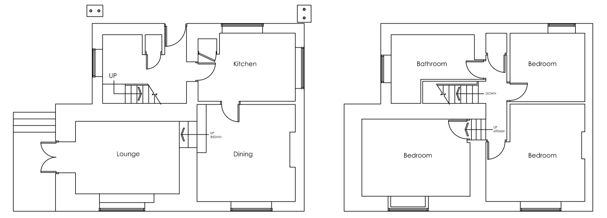
EXISTING FLOOR PLANS SCALE 1:100