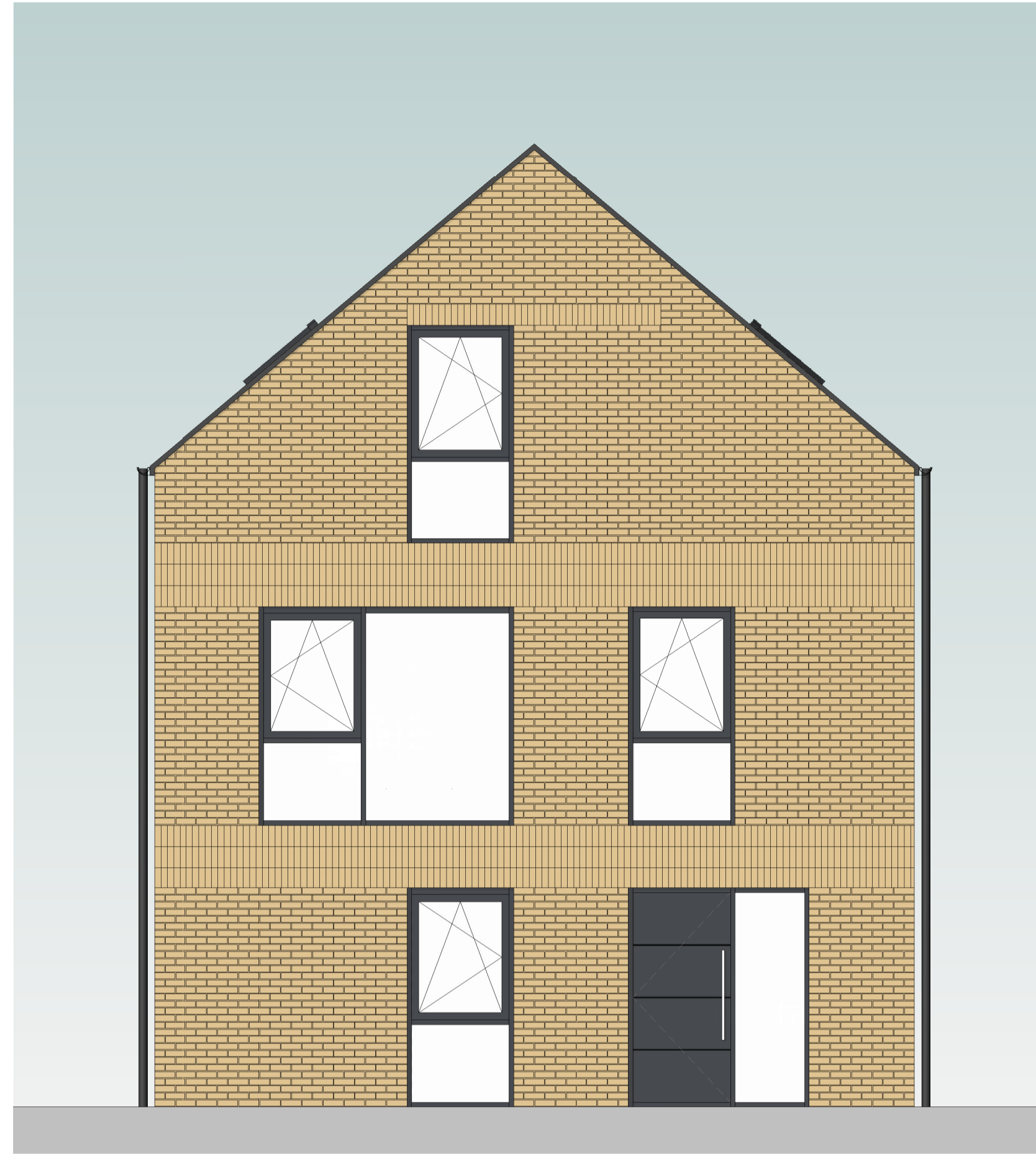
Front Elevation Scale: 1 : 50