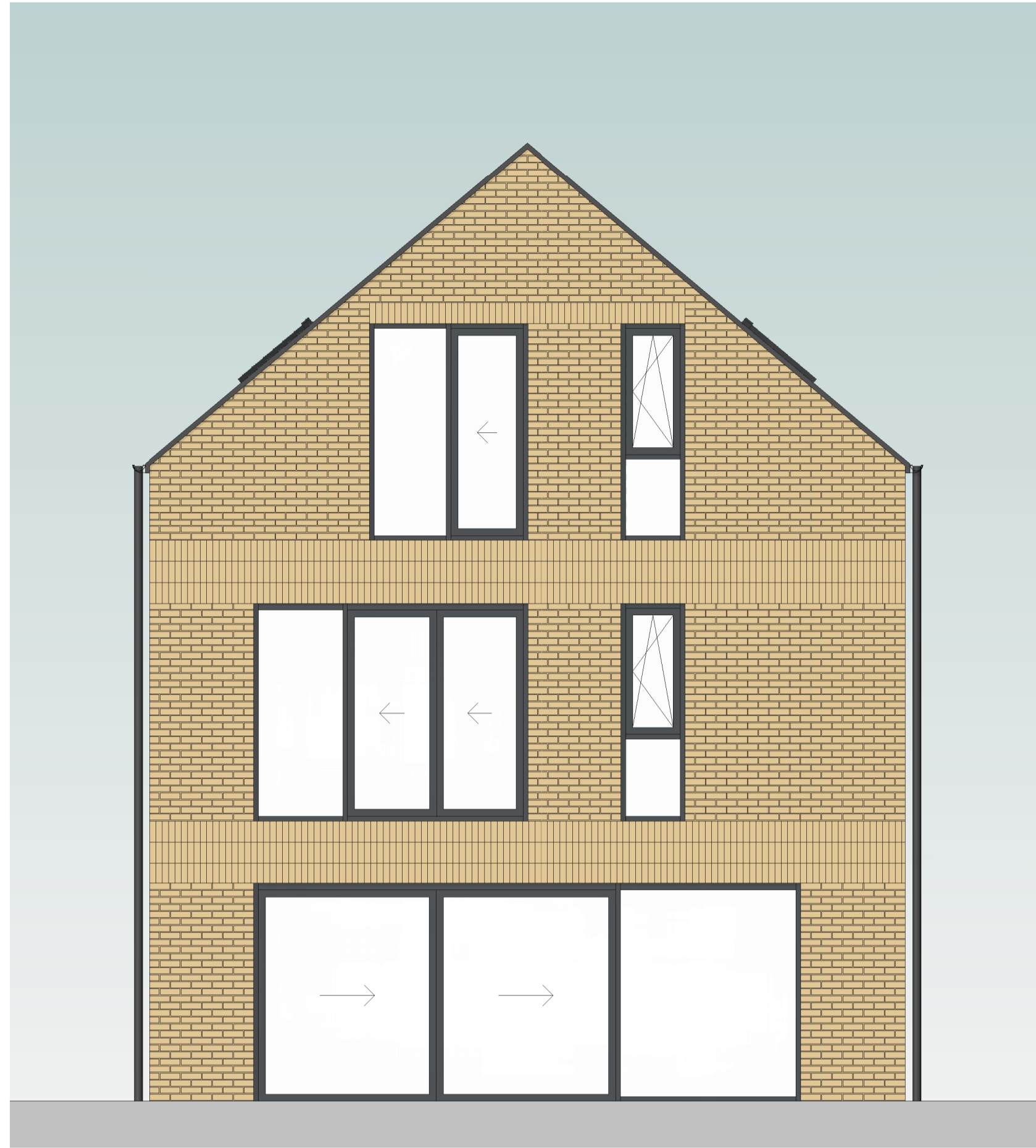
Rear Elevation Scale: 1 : 50