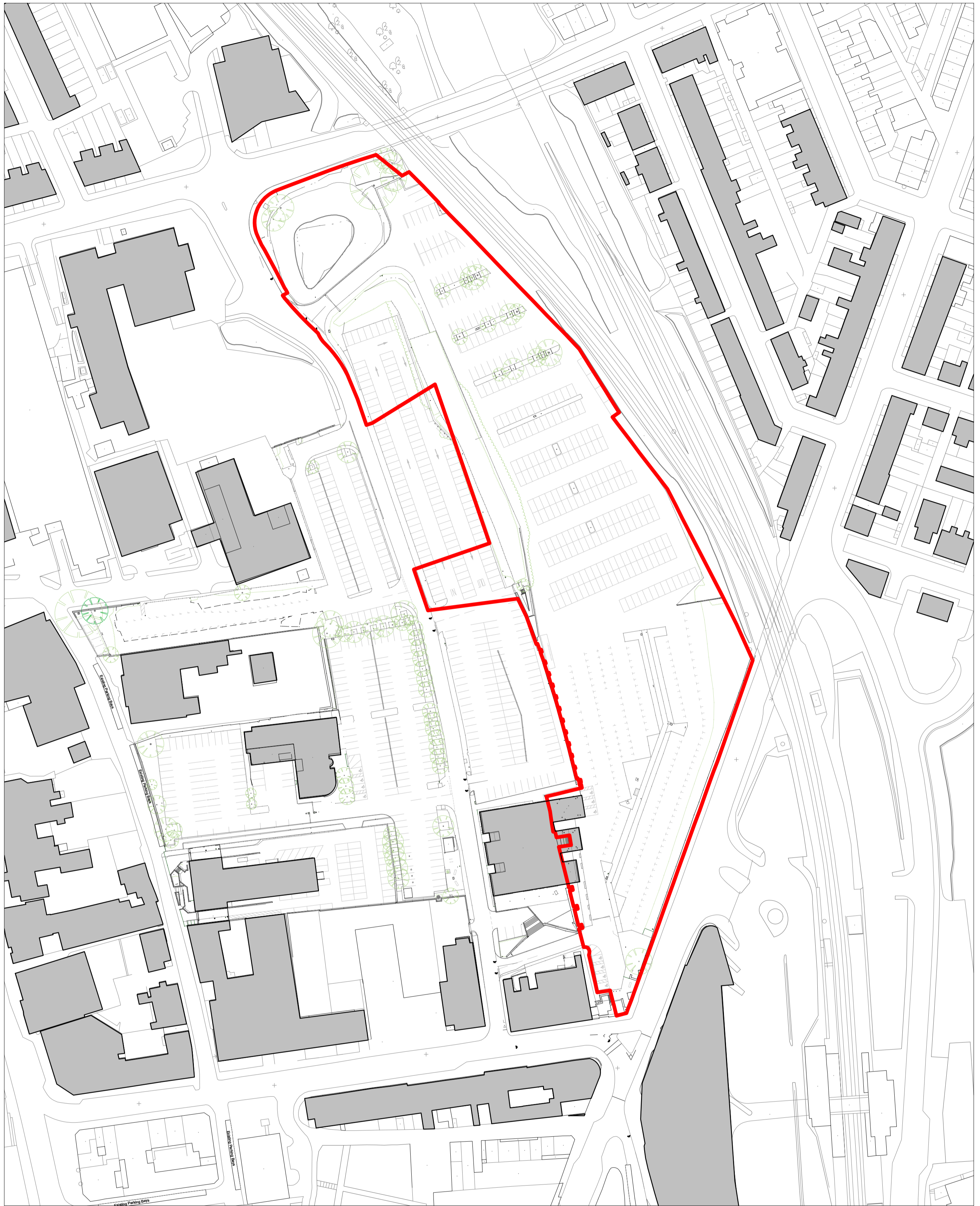
1 (00) - Existing Site Plan 1 : 1000