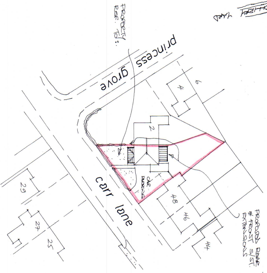
Site Layout 1:500