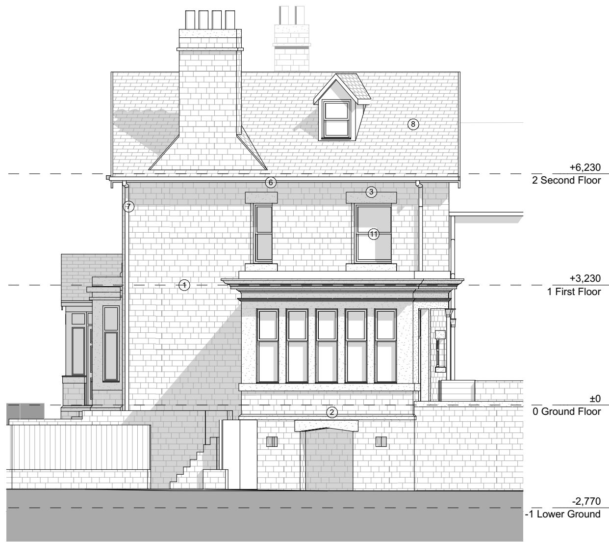
Existing East Elevation