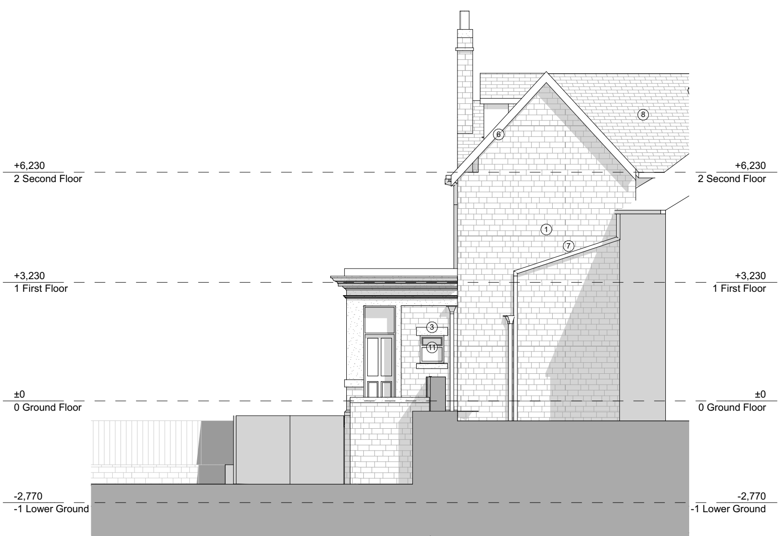
Existing NE Elevation