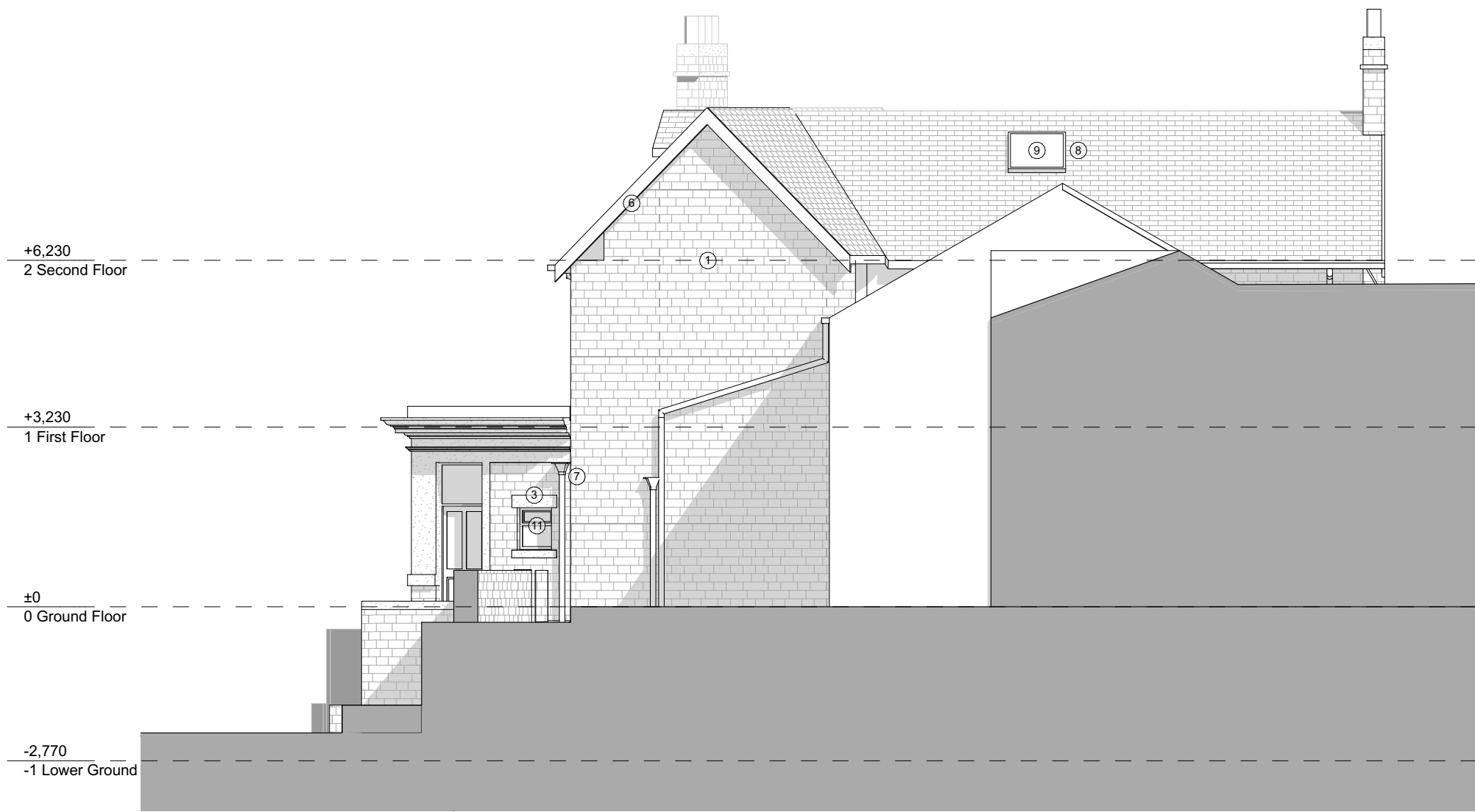
Existing North Elevation