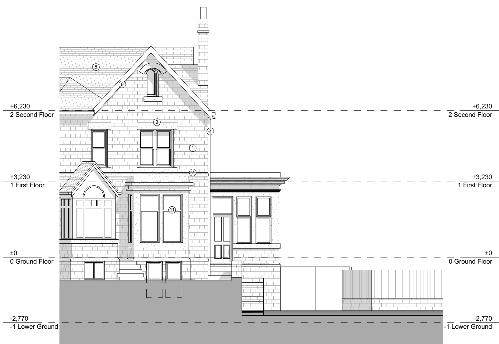
Existing SW Elevation