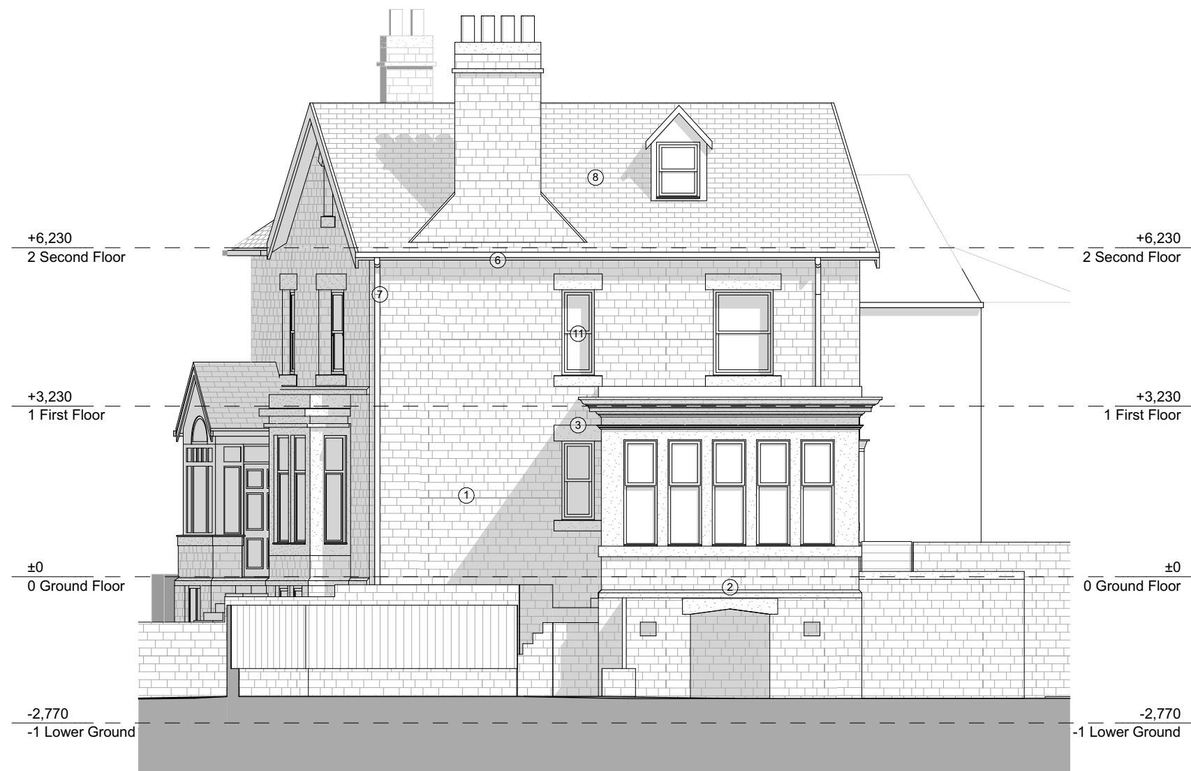
Existing SE Elevation