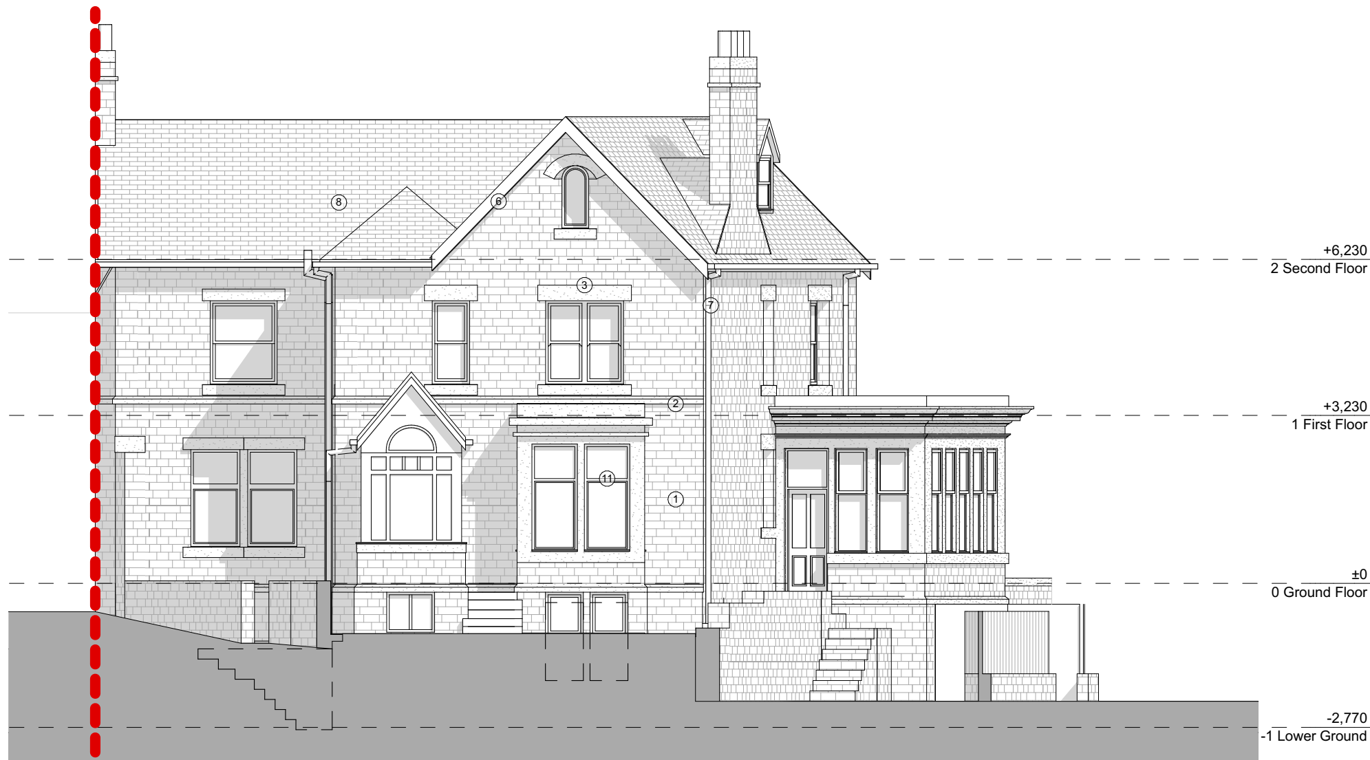
Existing South Elevation