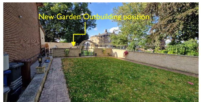
Northeast side of garden showing position of proposed Garden Outbuilding