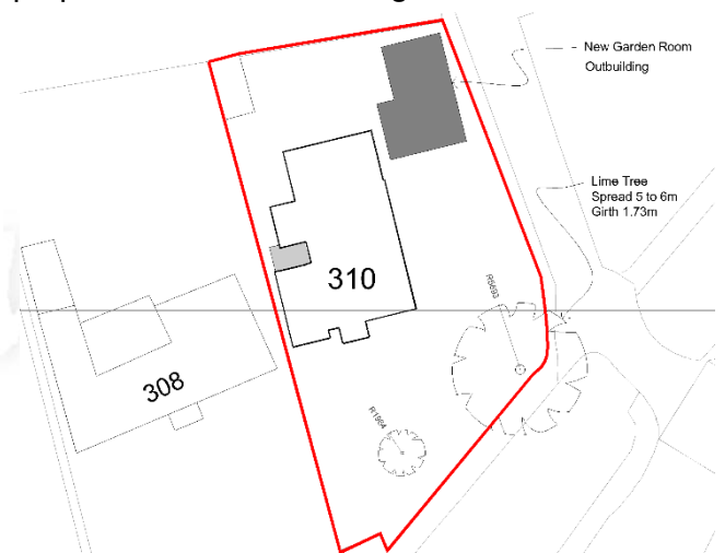
Tree Positions Plan (n.t.s.)