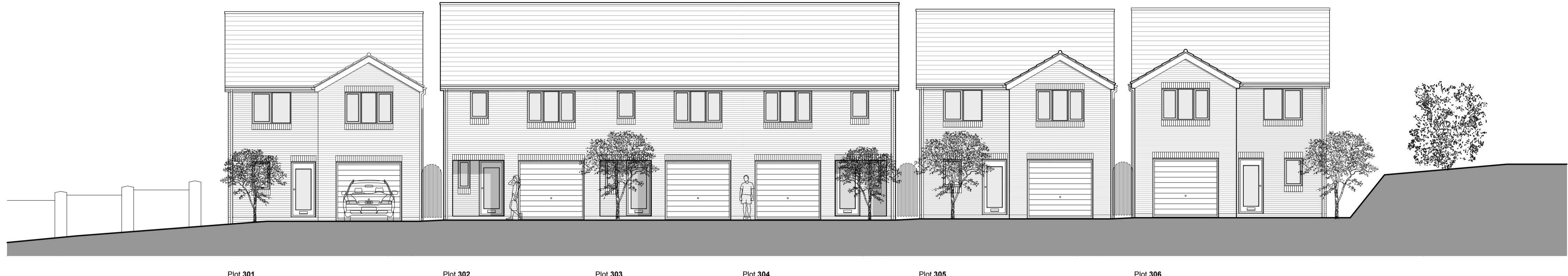
North Street Elevation

Note Design on this drawing is based on the proposal produced by Low Farm Properties for the site at Hawshaw Close, Platts Common, Barnsley under drawing refs: LFP/HC/SU/01 LFP/HC/S/01 LFP/HC/C/01 LFP/HC/S/01 LFP/HC/W/01 Proposals provided have adapted the layouts portrayed across the above drawings to meet the client's brief and generate a positive and viable scheme on which Planning permission is to be obtained. The layouts put forward work to the constraints of the site and allow for the significant change in level, as documented within supporting drawings and documents.