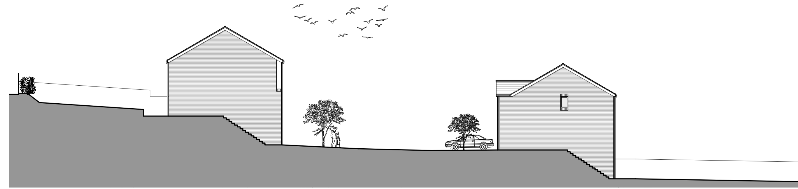
Section BB Street Cross Section