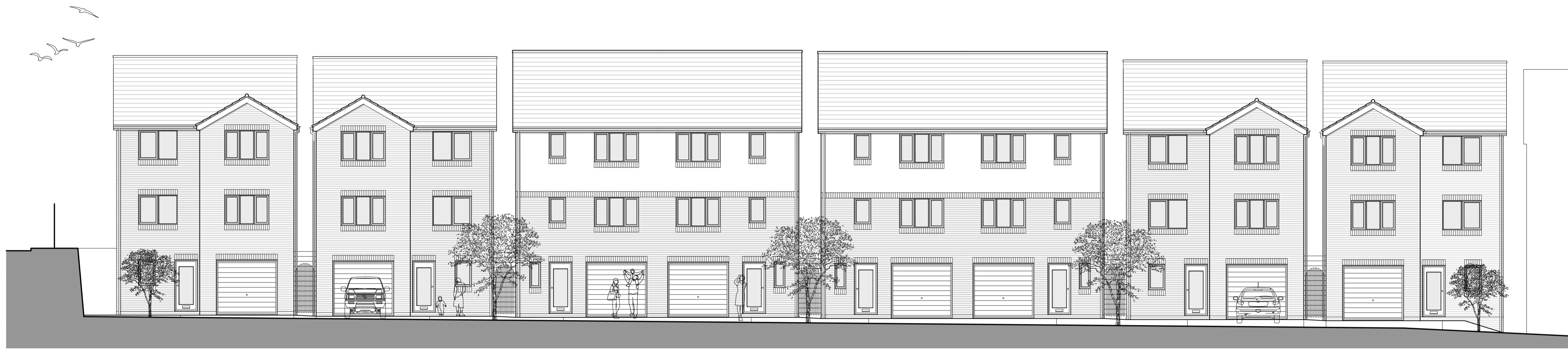
South Street Elevation