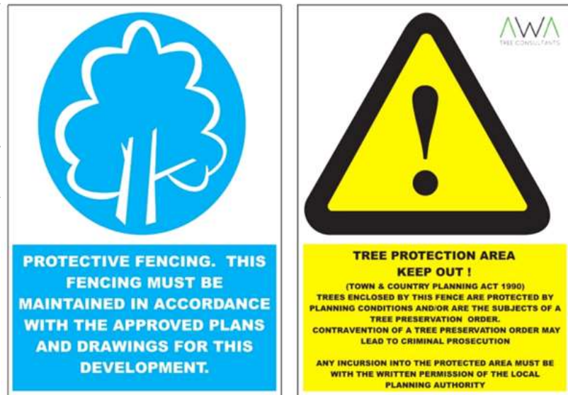
Inset 1: Warning Signs for Fencing