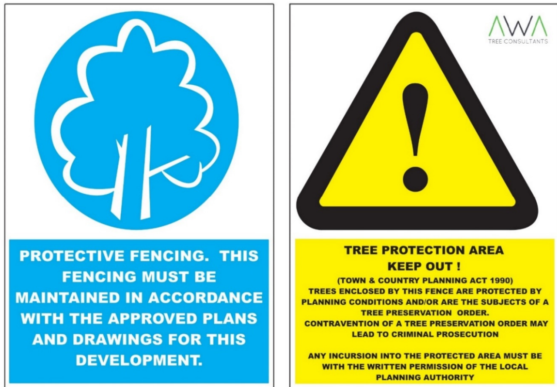
Figure 1: Warning sign for fencing