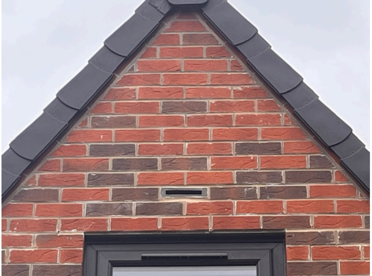
Bat box 1 to gable