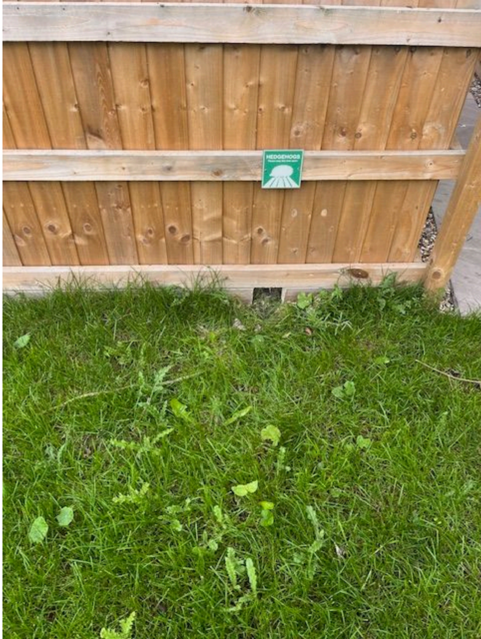
Signposted Hedgehog Highway