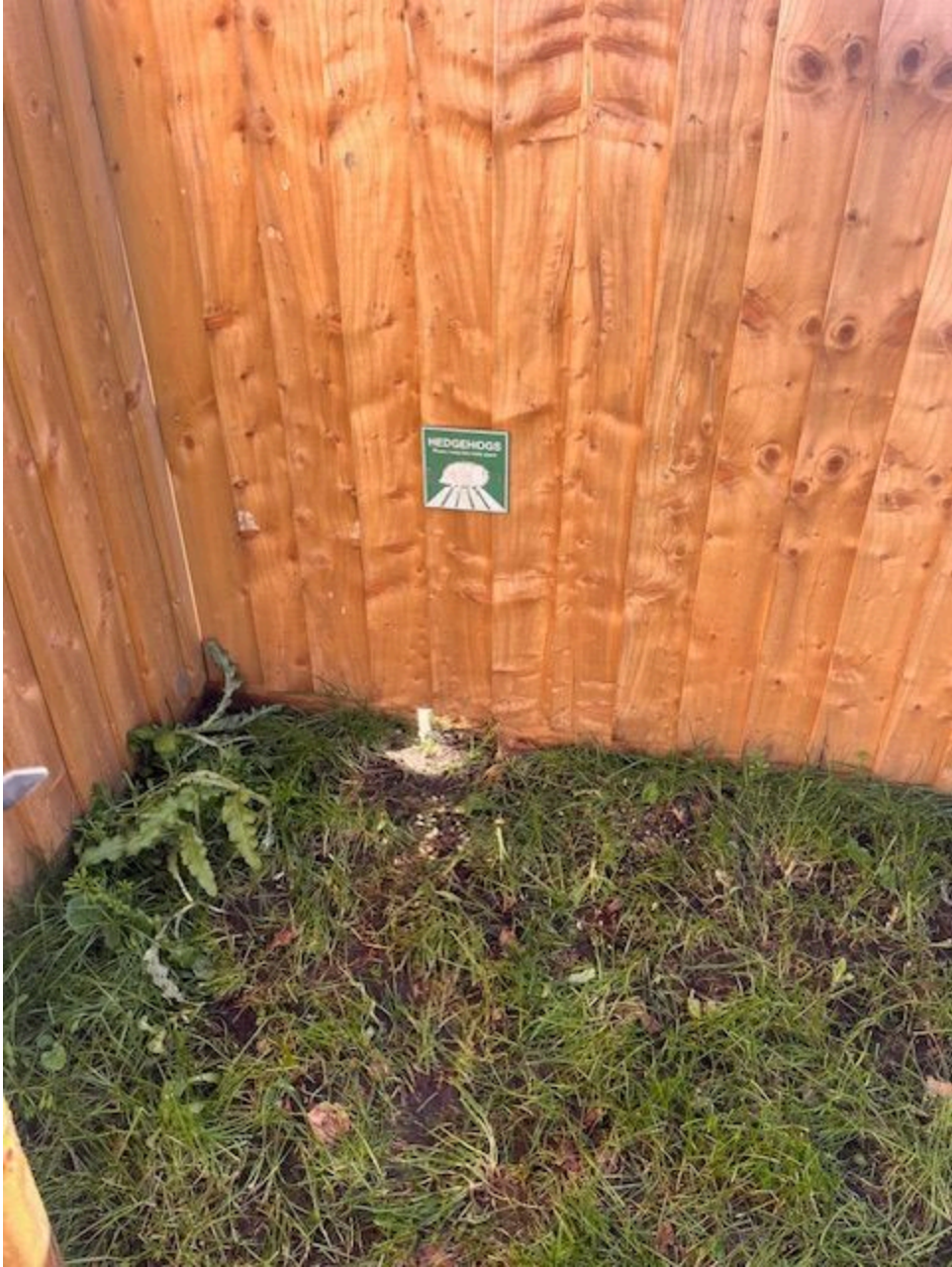
Signposted Hedgehog highway