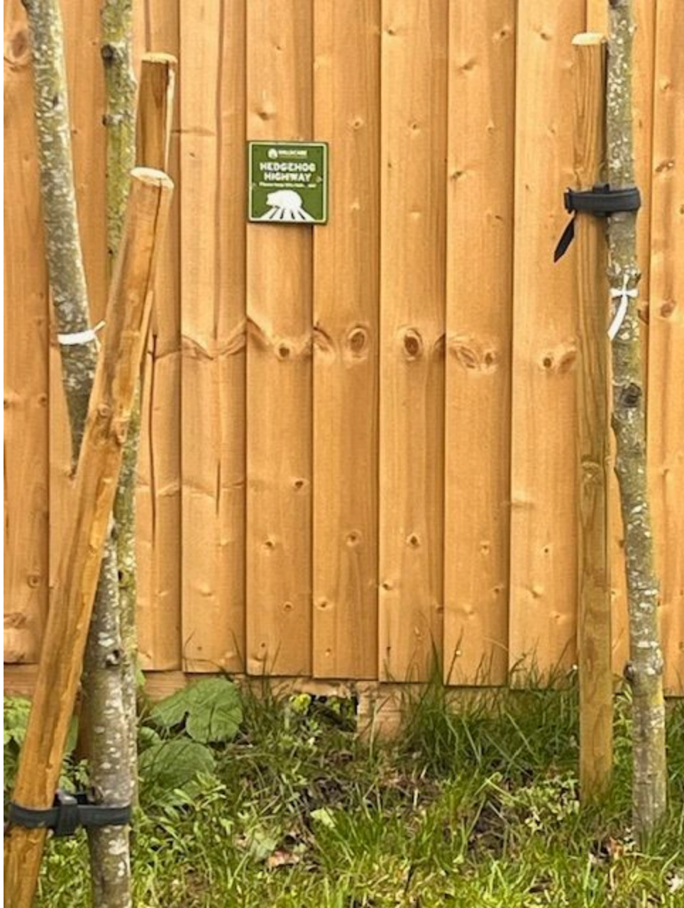
Signposted hedgehog highway