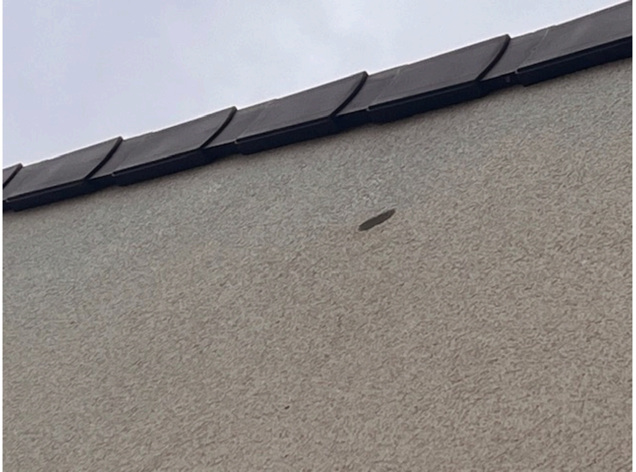
Swift box 1