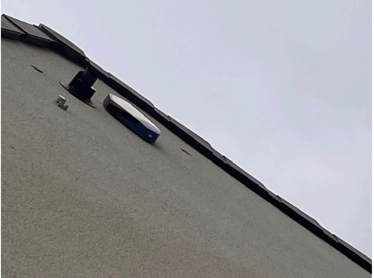
Swift boxes 2 & 3