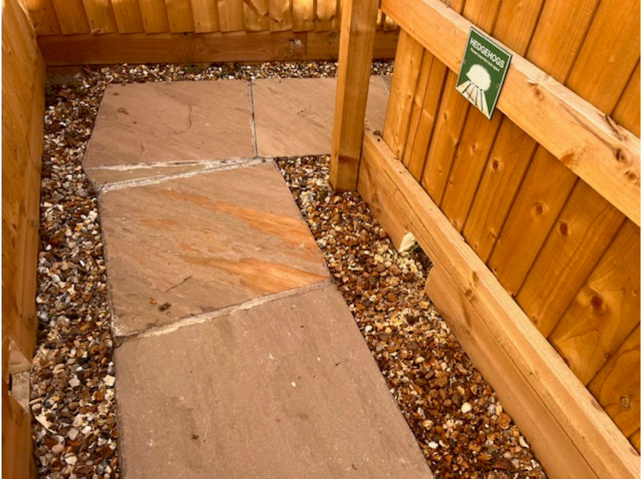
Signposted Hedgehog highway