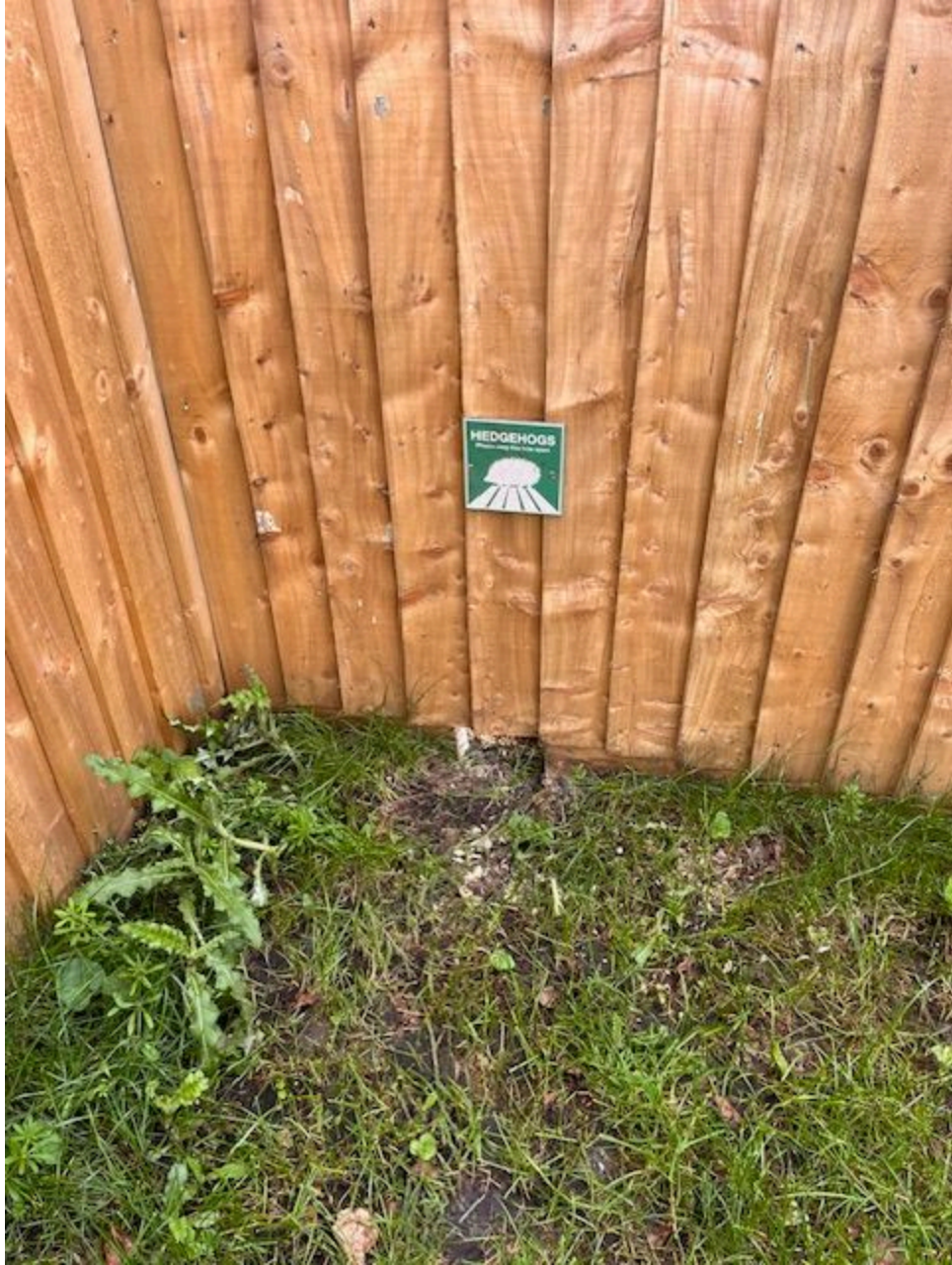
Signposted Hedgehog Highway