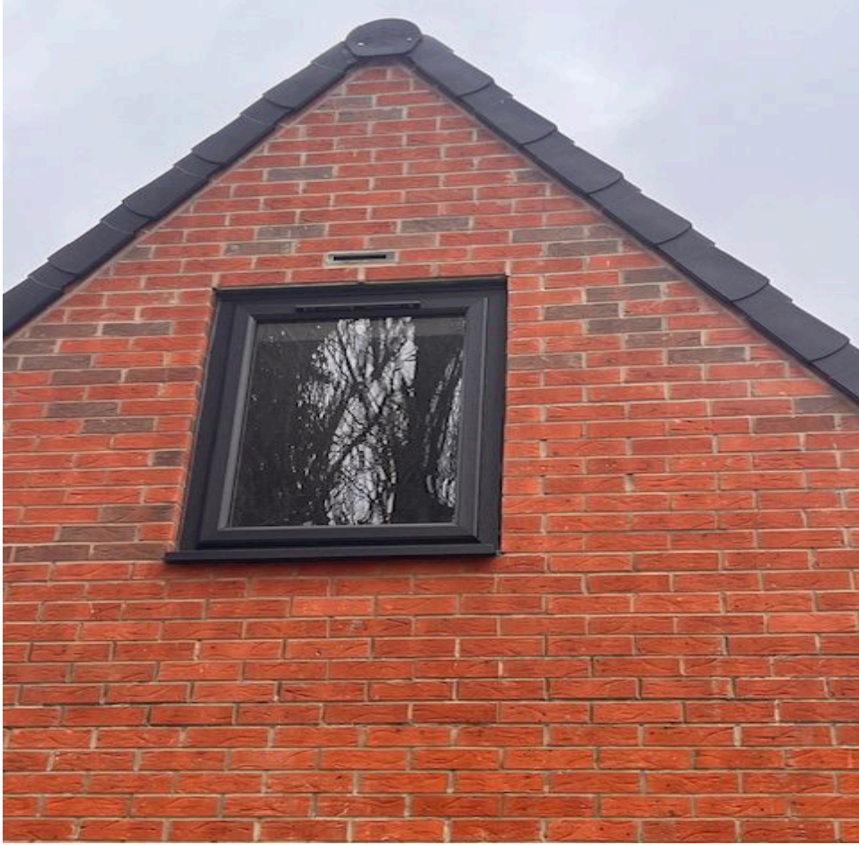
Bat box 3 to gable