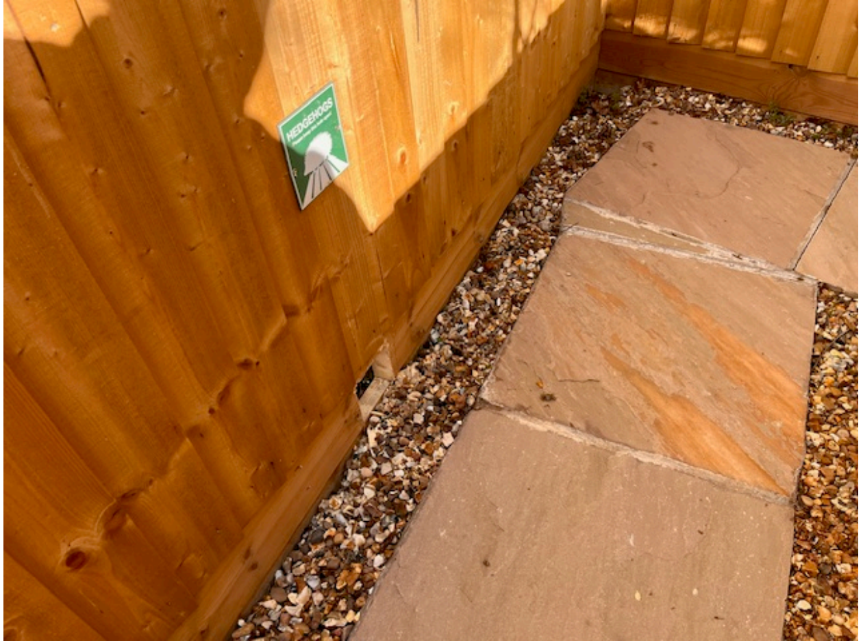
Signposted Hedgehog highway