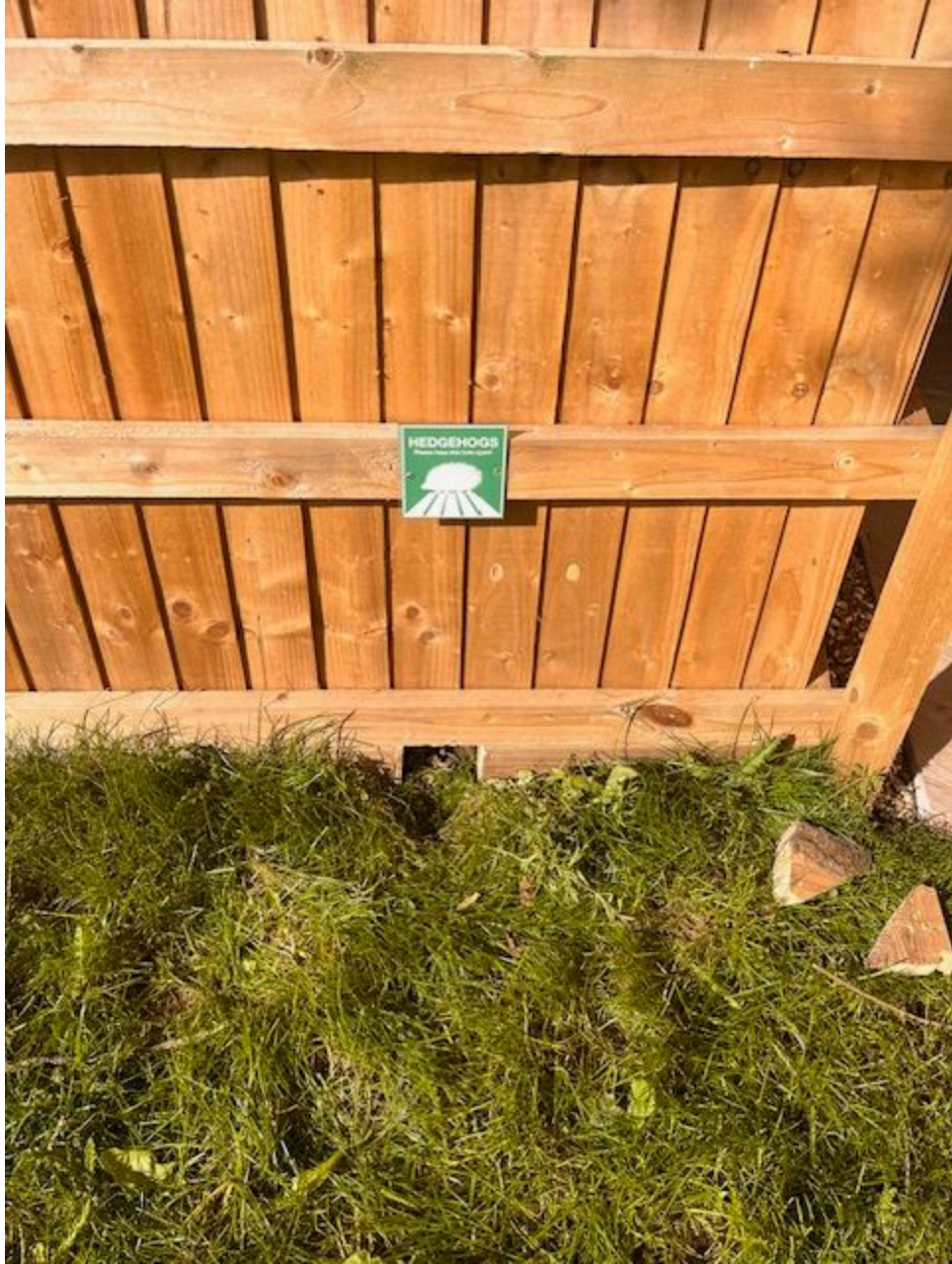
Signposted Hedgehog highway