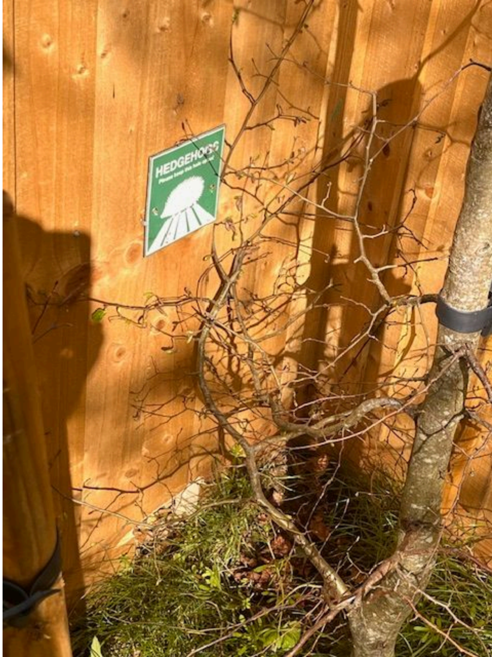
Signposted Hedgehog highway