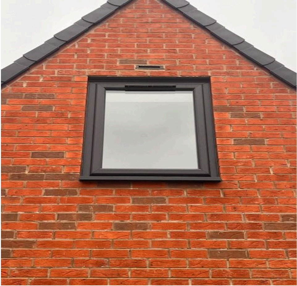
Bat box 2 to gable