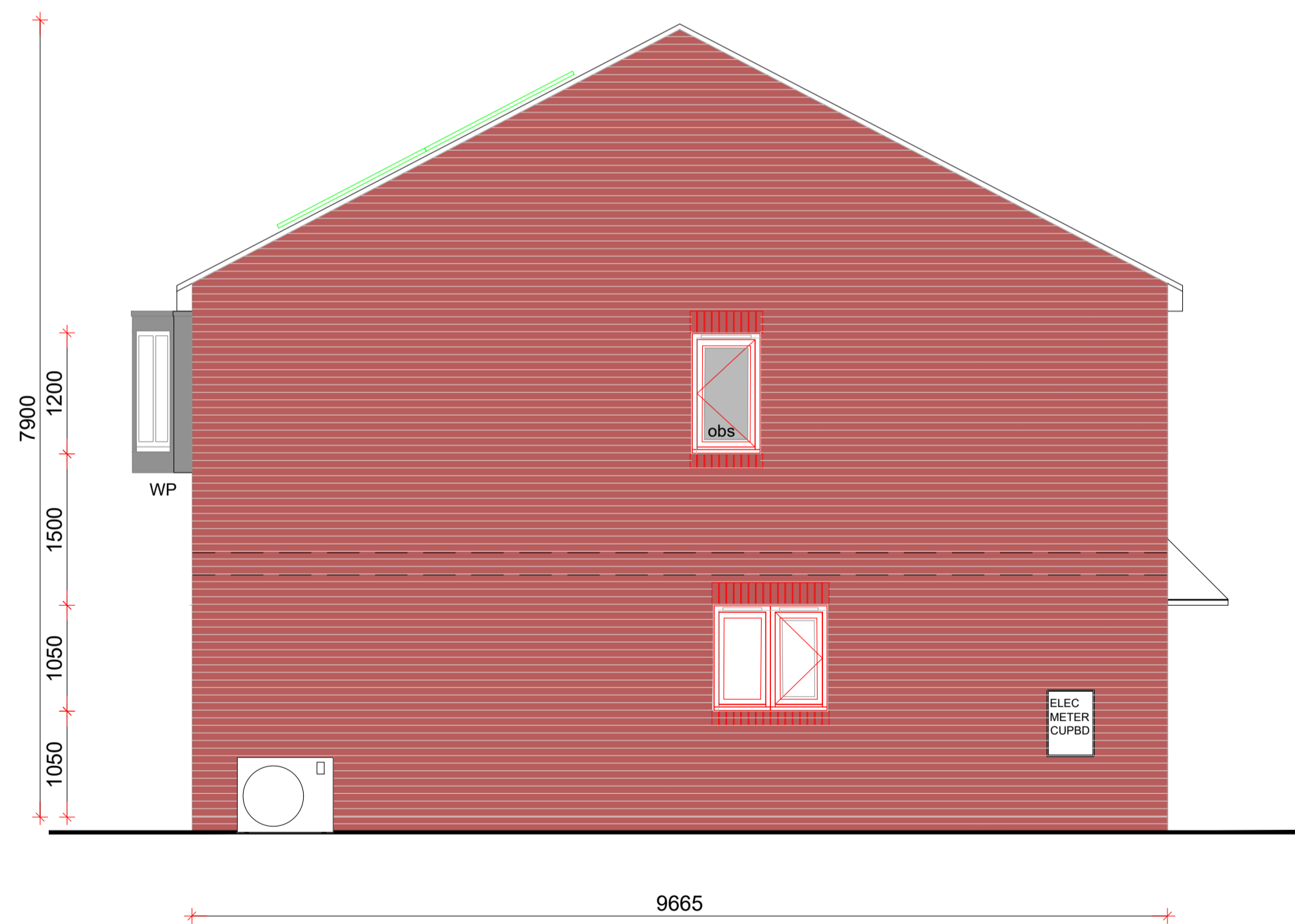
SOUTH EAST FACING (SIDE) ELEVATION - PLOT 5