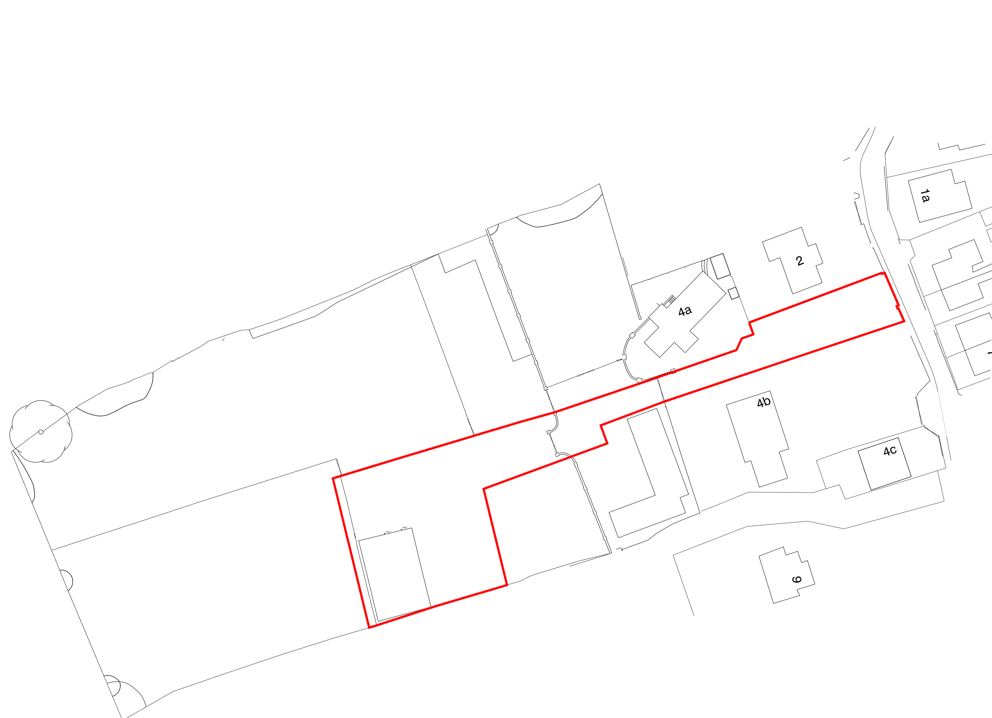
EXISTING SITE PLAN SCALE 1:500