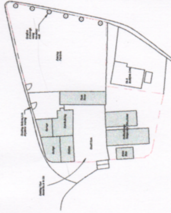
2 Site Plan 1 : 500