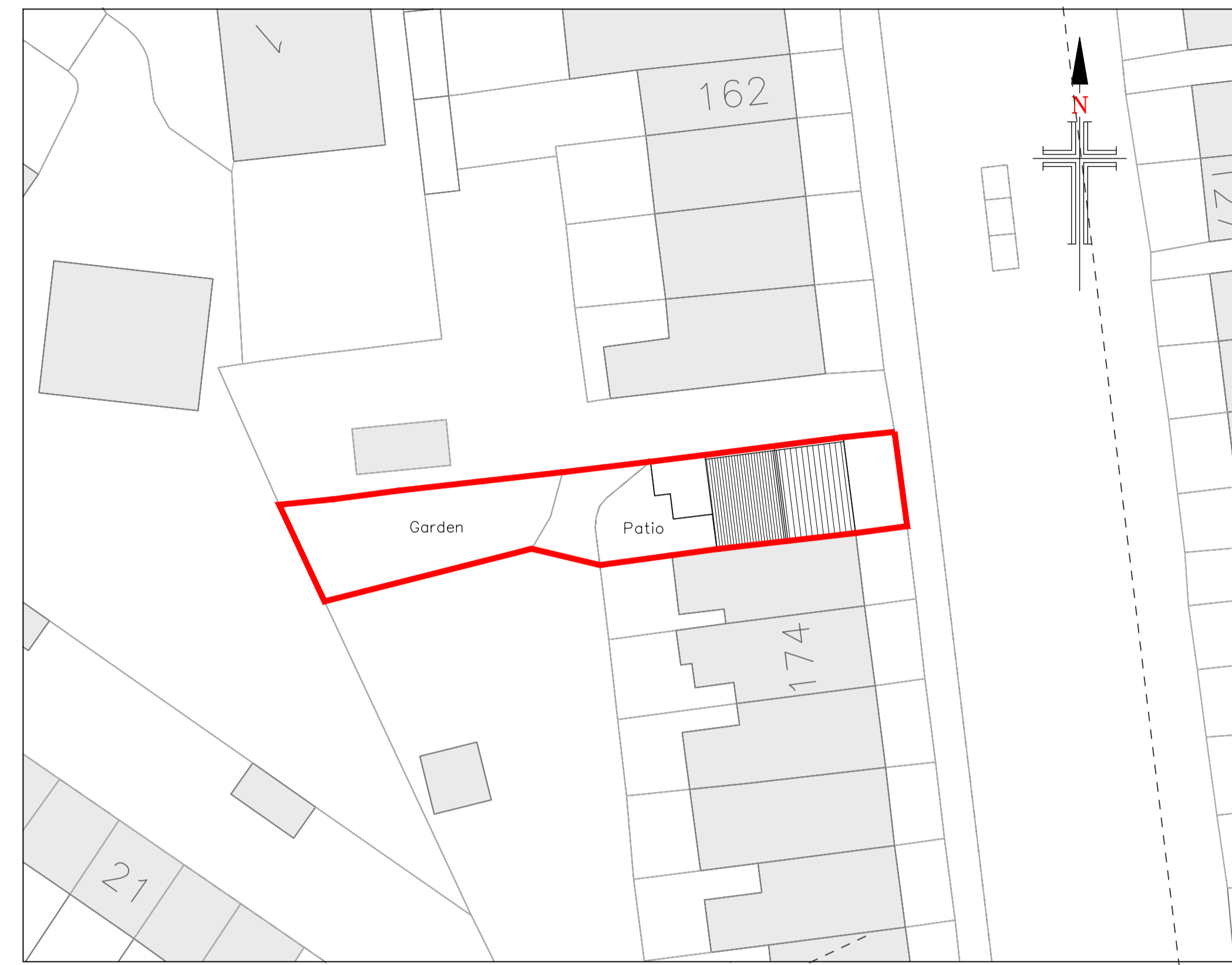
Existing Ground Floor Layout Scale 1:50