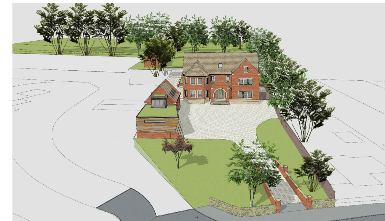
SITE PERSPECTIVE VIEWS