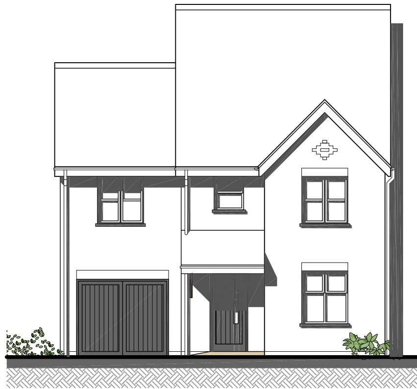
Handed Front Elevation