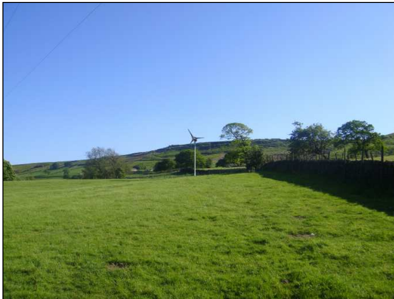
Figure 1: An example of an existing Proven turbine

The design of the turbine is that which has a fairly utilitarian and simple appearance. The materials used are black and grey matte finished metal which will have a fairly benign impact on its surroundings.