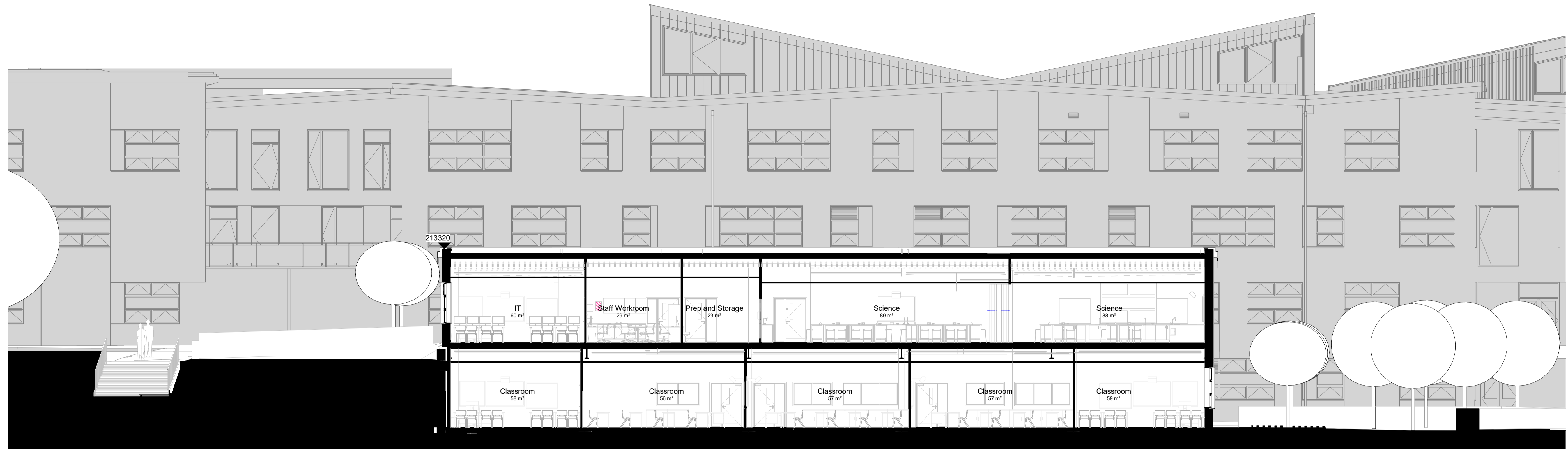
1 Longitudinal Section Site 1:100 Ref Sheet: 0301