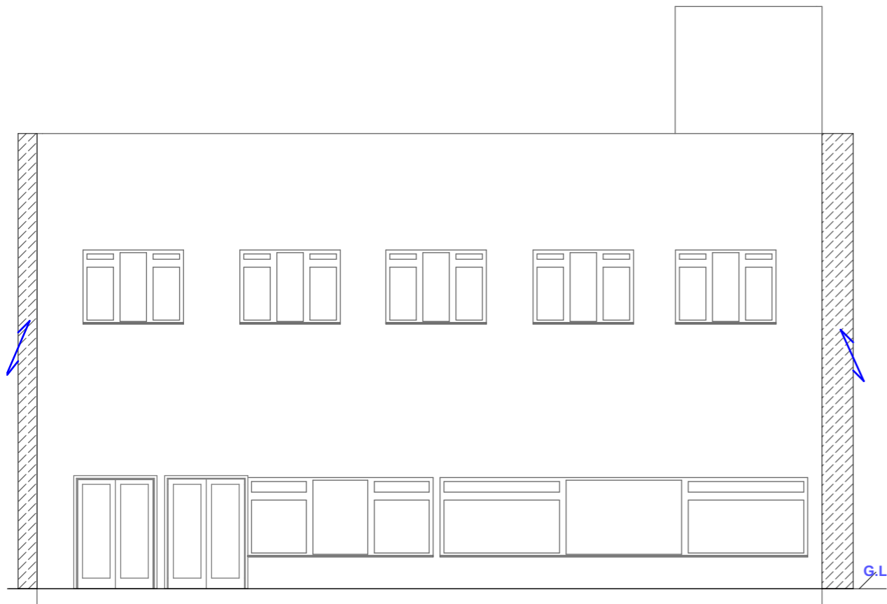
1 Front Elevation (7) 1:100 2