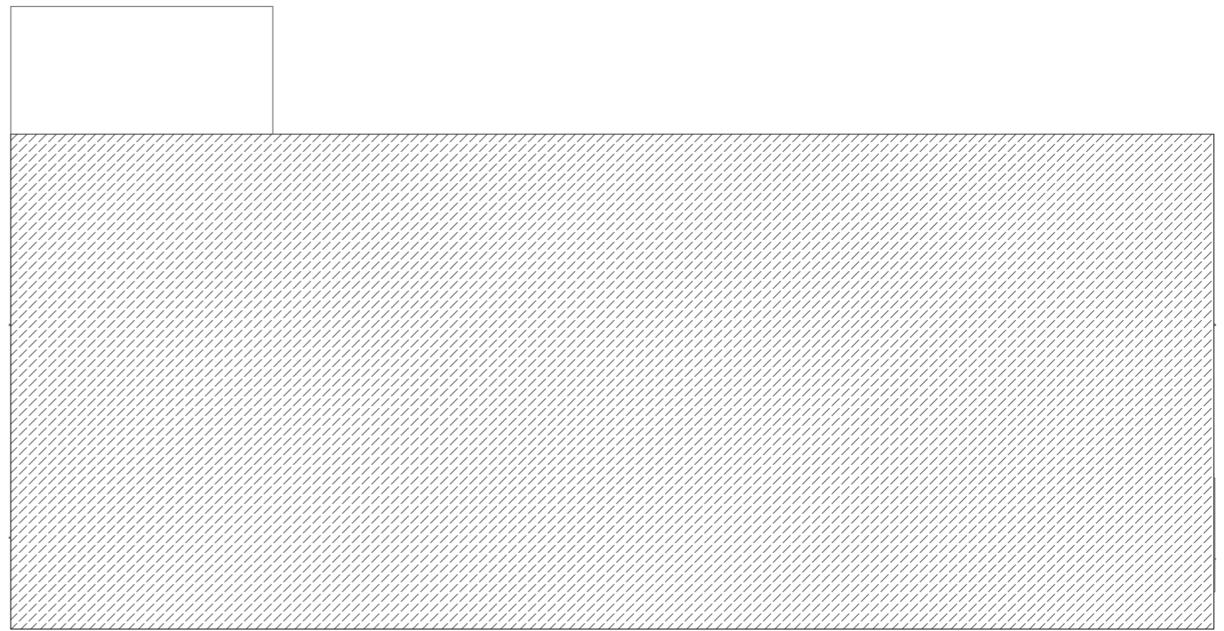
Left Elevation (7) 1:10