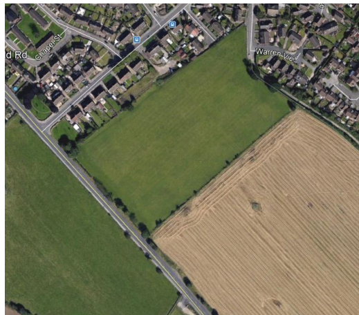
Figure 1: Aerial View of the site – GoogleEarth