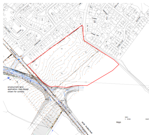
Figure 2: Redline area of the application site