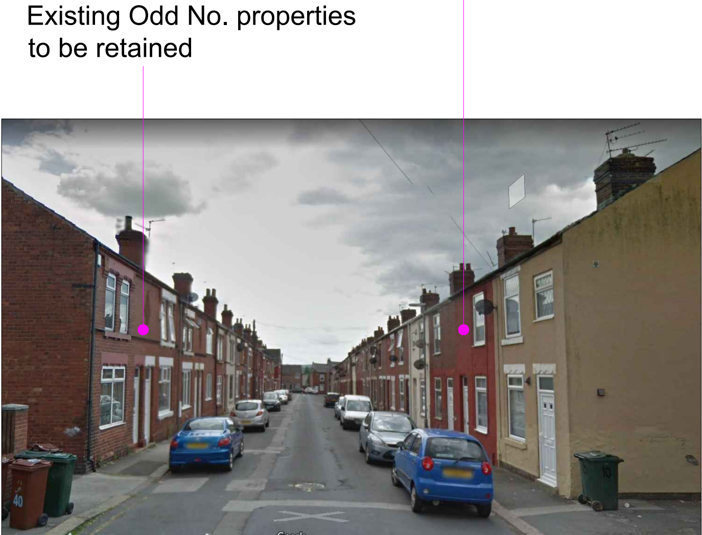
Photo 5 - Victoria Street looking South with Alleyways in foreground to Cooperative Street on RHS and Beaver Street on LHS