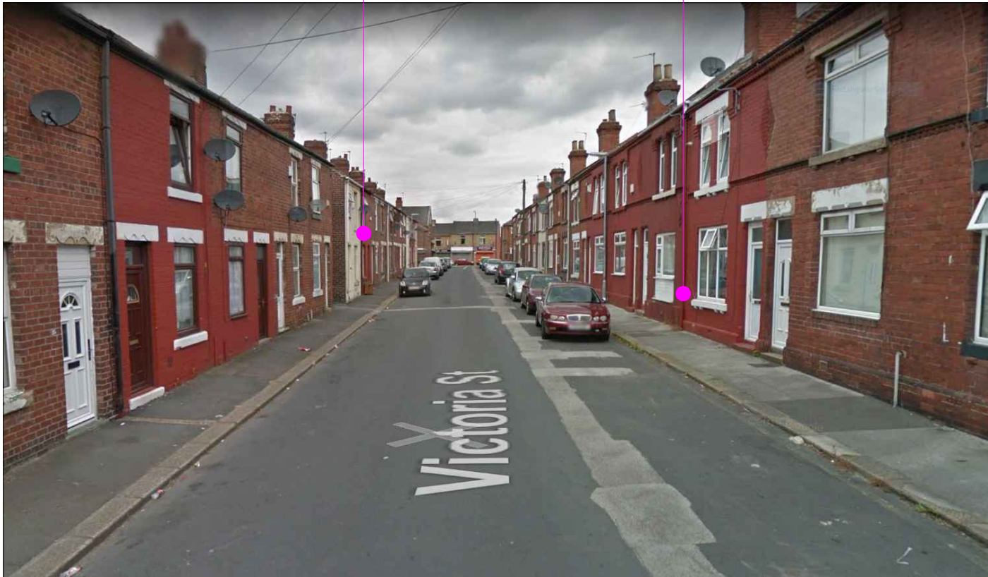
Photo 6 - Victoria Street looking North towards Doncaster Road

DO NOT SCALE FROM THIS DRAWING. ALL DIMENSIONS TO BE CHECKED ON SITE BY CONTRACTOR. REPORT ANY DISCREPANCIES TO DRAWING AUTHOR AND PROPERTY SERVICES TEAM. DRAWING OR CONTENTS SHOULD NOT BE DUPLICATED WITHOUT PRIOR CONSENT.