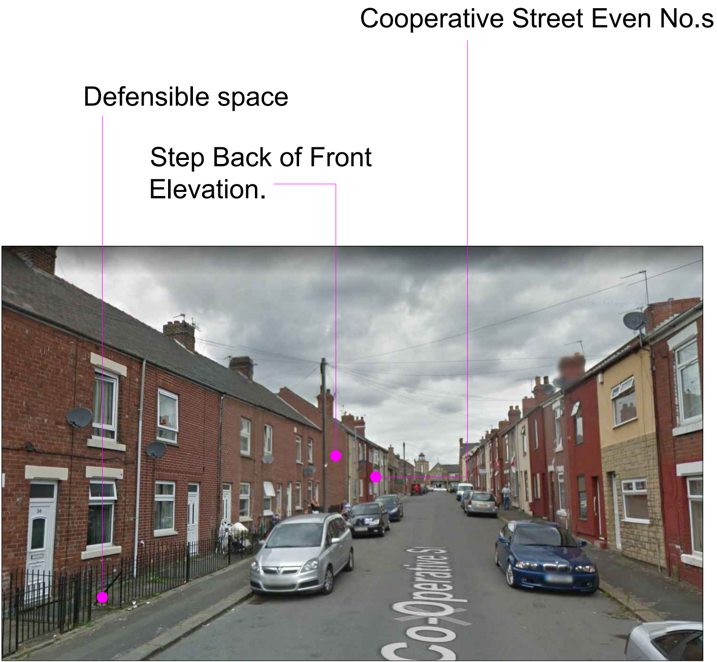
Photo 3 - Cooperative Street looking North towards Doncaster Road

NOTE: FOR LAYOUT OF PROPERTIES TO BE DEMOLISHED REFER TO DRAWING GHP-PH1-SK-A-21