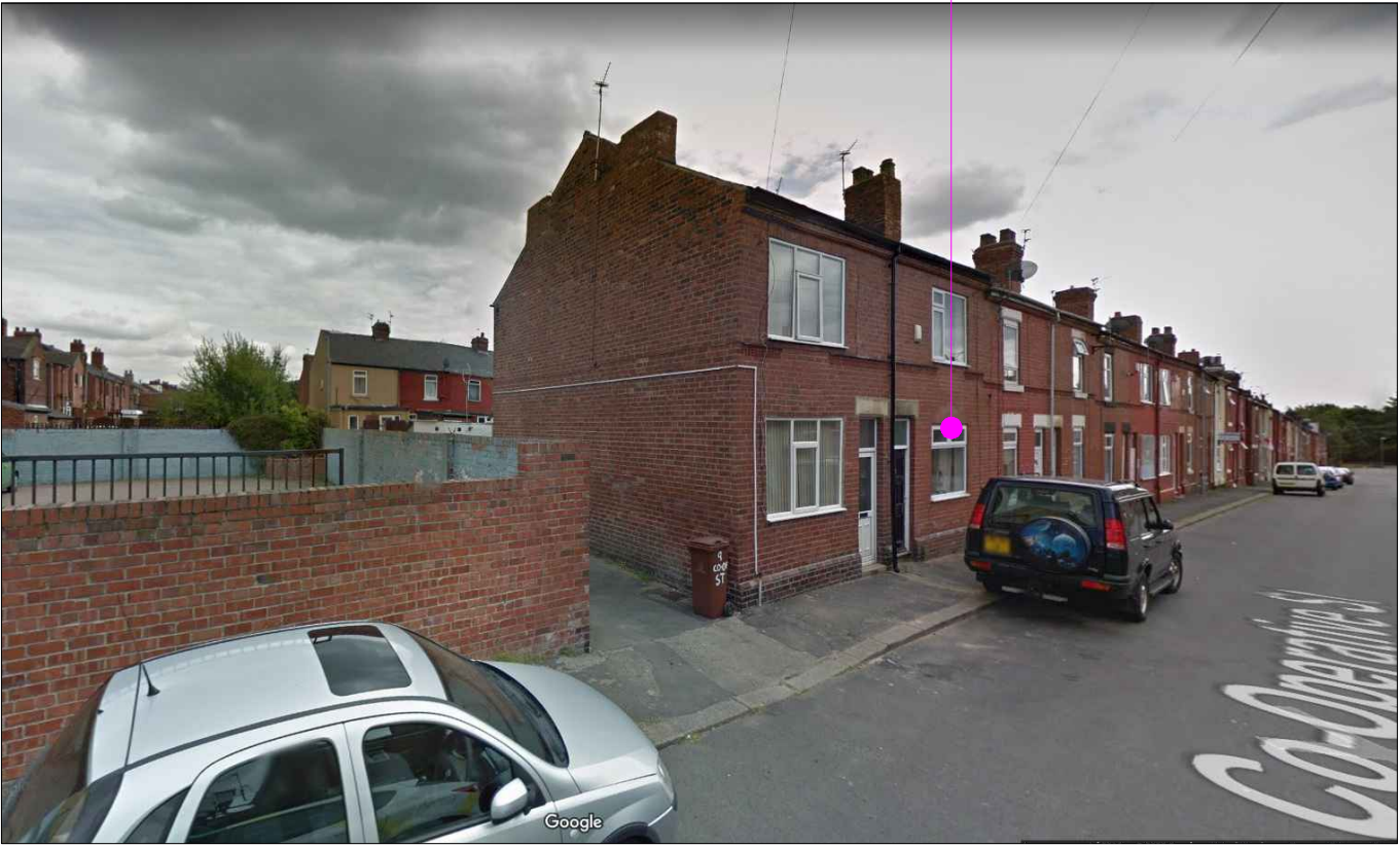
Photo 2 - Cooperative Street (Odd No.s) looking South with Alleyway through to Victoria Street on LHS

Cooperative Street (Odd No.s) To Be Demolished: No. 1, No. 3, No. 5, No. 7, No. 9, No. 11 No. 13, No. 15, No. 17, No. 19, No. 21 No. 23. (12 No. Properties) Note: No. 25 Will require treatment to existing gable end and introduction of new feature bay window to Lounge.