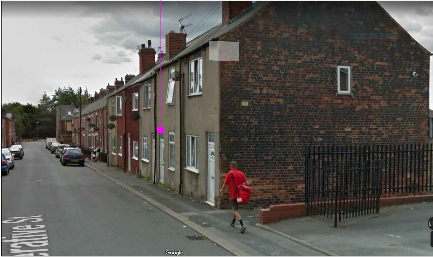
Photo 1 - Cooperative Street (Even No.s) looking South with entrance to Golden Nuggett Club on RHS

Cooperative Street (Even No.s) To be Demolished: No. 8, No. 10, No. 12, No. 14 No. 16, No. 18. (6 No. Properties) Note: No. 20 Will require formation of new gable end (including roofing works to form new verges following demolition of No. 18).