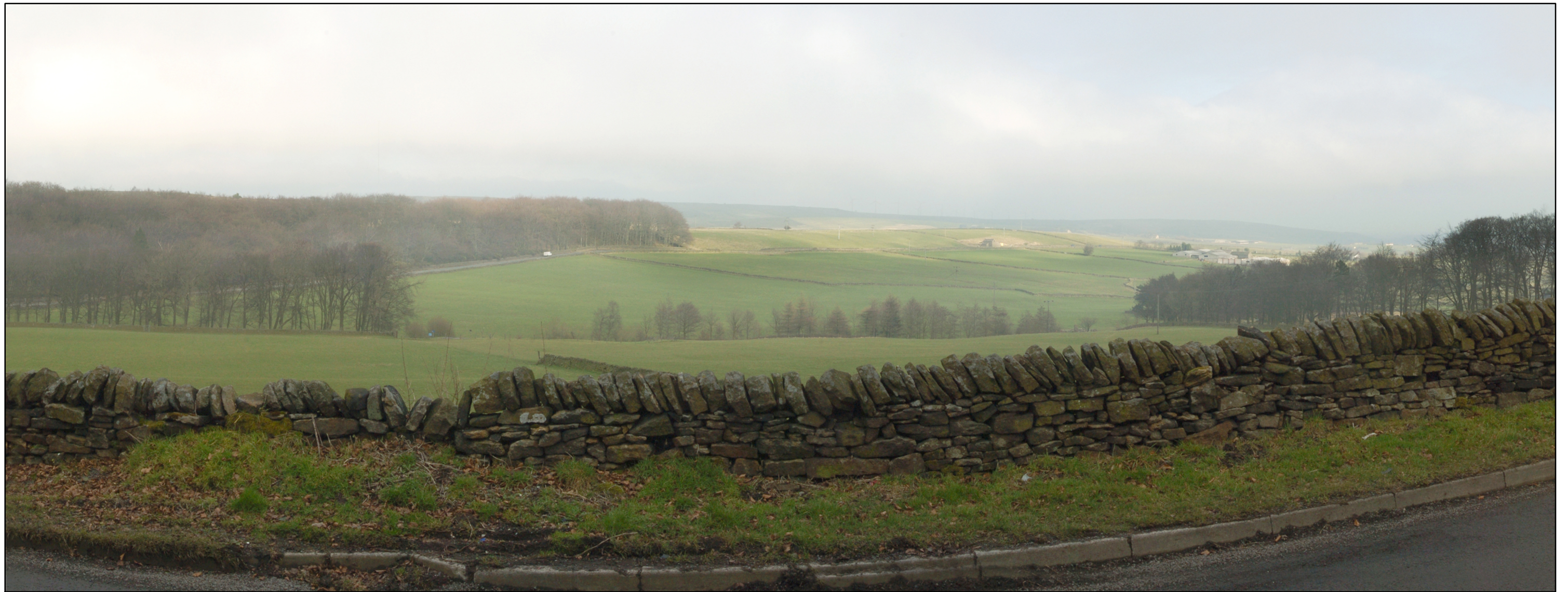
Existing view from viewpoint