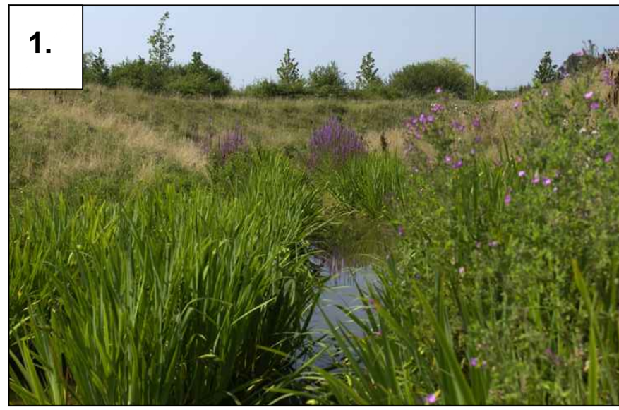
1. Biodiverse open attenuation swale features