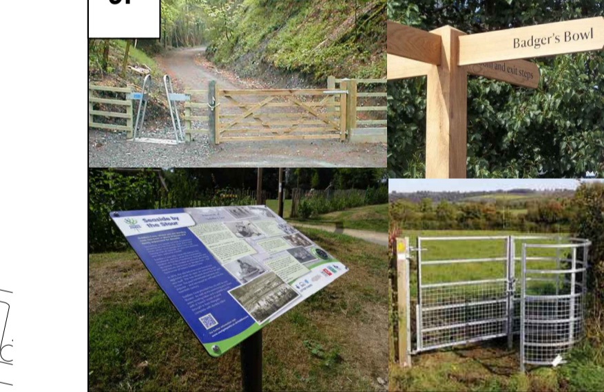
10. Access control and signage/interpretation to footpath routes