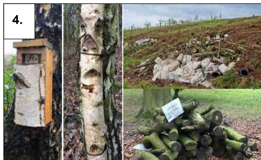
5. Ecological enhancements along Carr Dike corridor: Wet woodland management to be implemented to create a mosaic of woodland / marshy grassland / scrub through selective thinning and coppicing over 30-year period under direction of qualified ecologist. A range of ecological enhancements will be provided which may include bat and bird boxes suitable for selected species, log piles and refugia. Areas will be provided with specialist enhancement to promote use by willow tit including management of the woodland mosaic and provision of decaying wood to promote nesting and foraging. Care will be taken to avoid conflicting use by competing species of birds where possible.