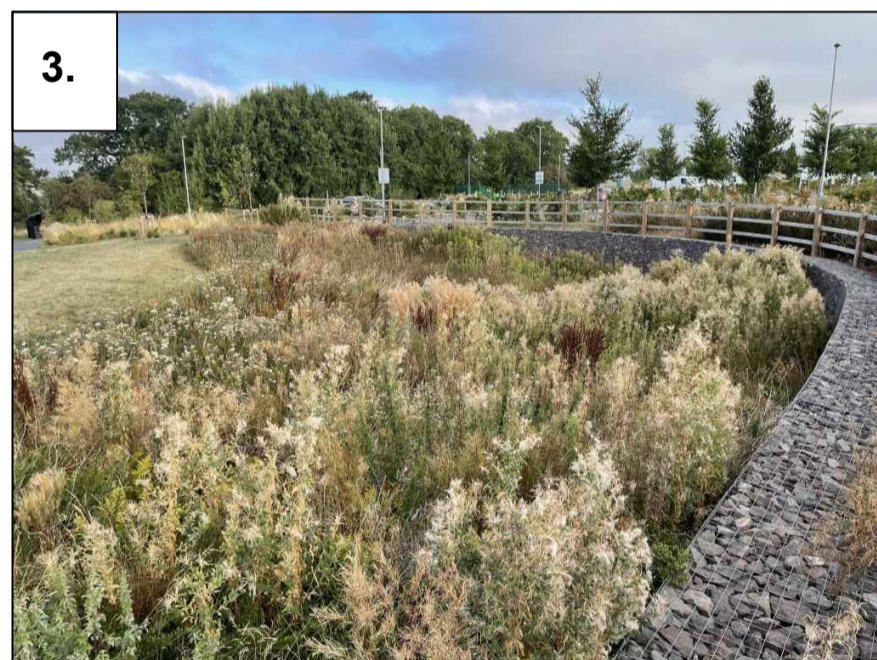
4. Ecologically sensitive designed culverts with mammal ledges/tunnels