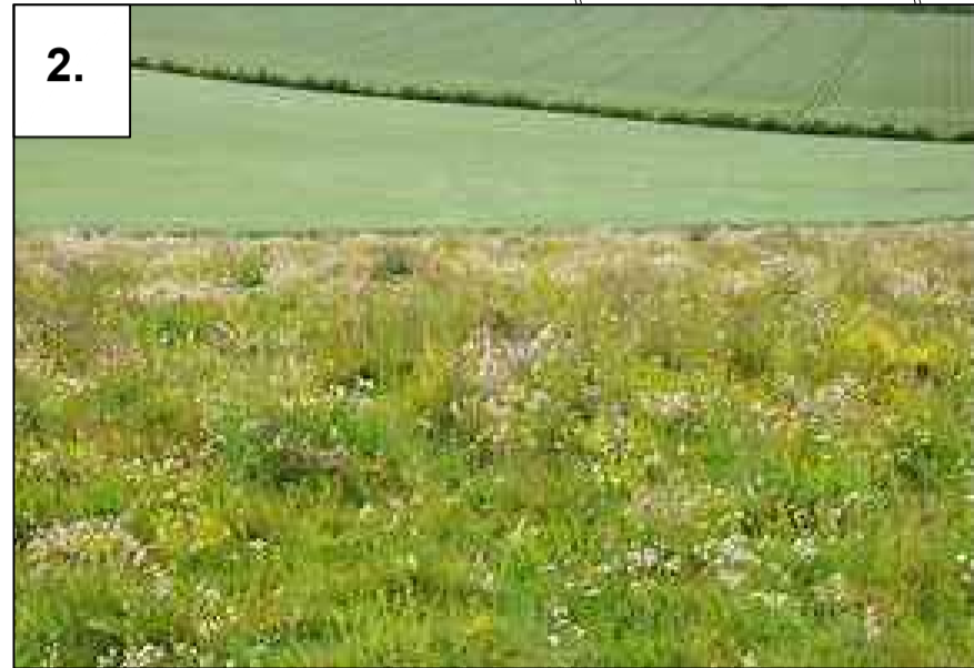
2. Marsh Harrier potential habitat enhancements within attenuation