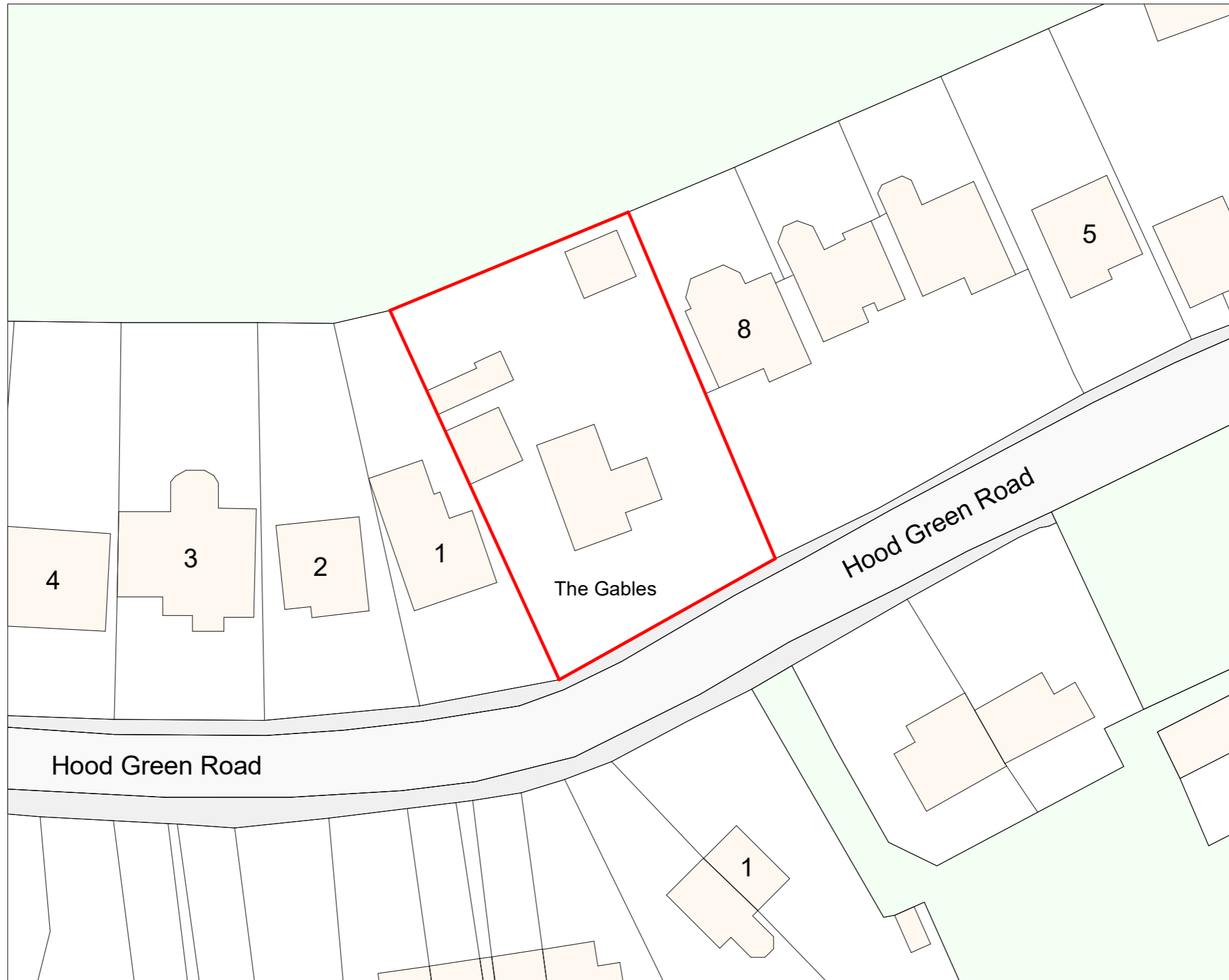
Block Plan Scale 1 : 500