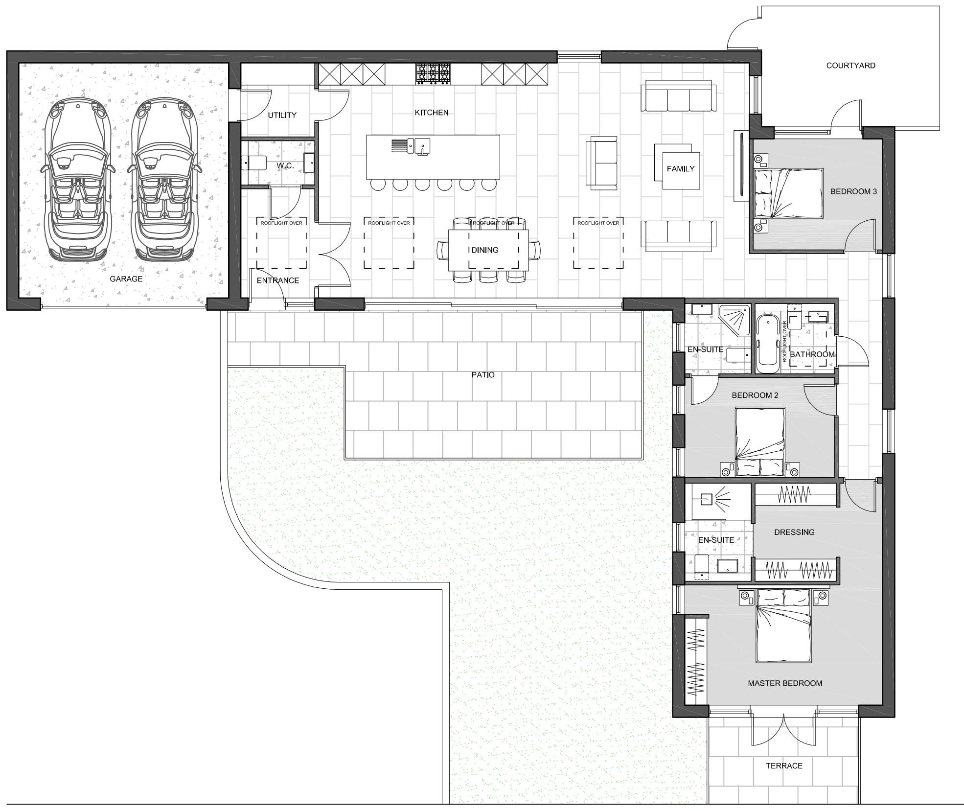
PROPOSED PLAN SCALE 1:100