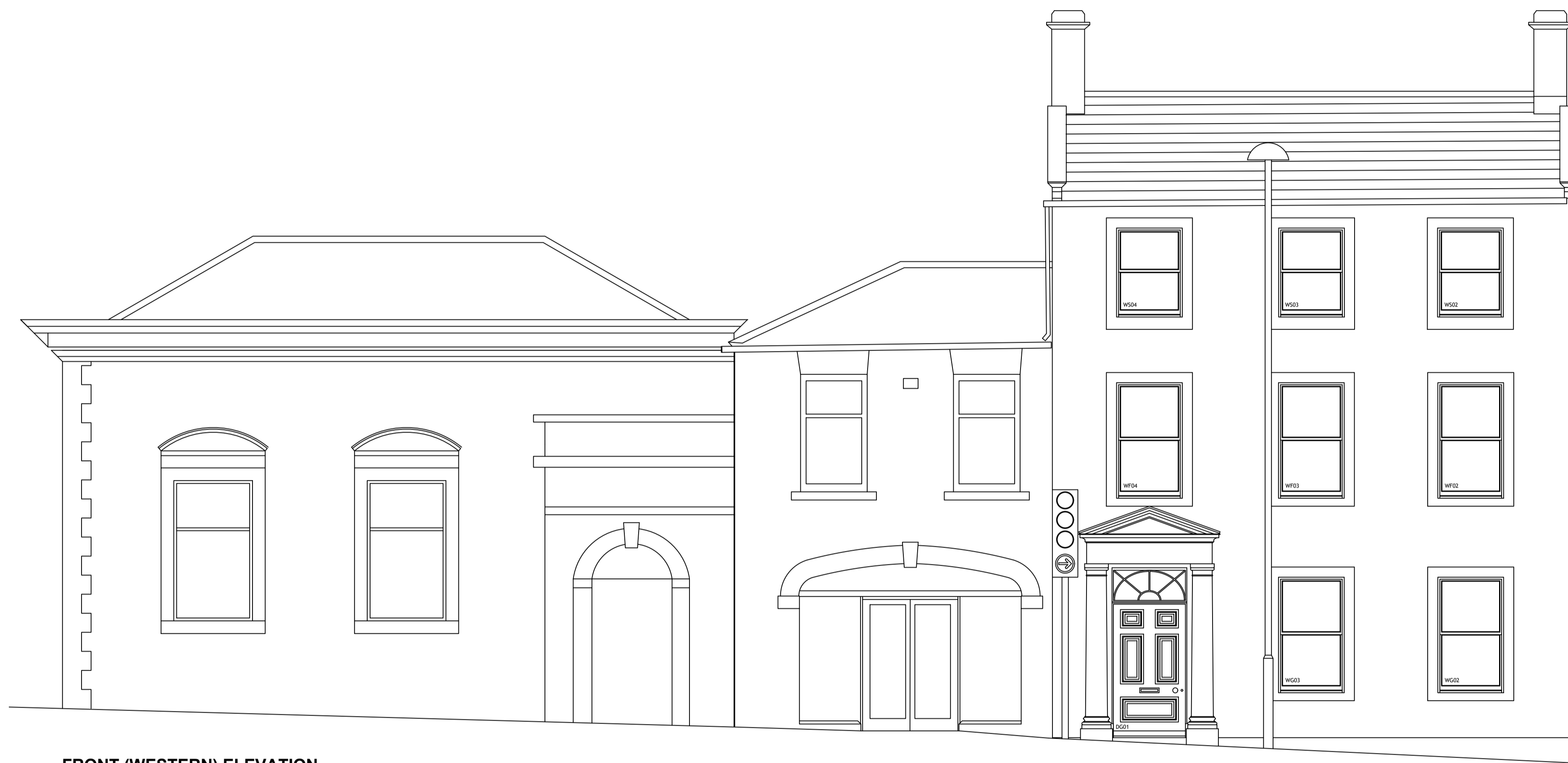
FRONT (WESTERN) ELEVATION