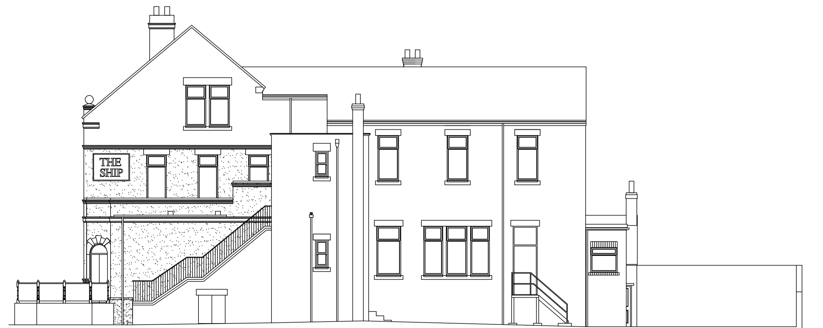
EXISTING EAST ELEVATIONS