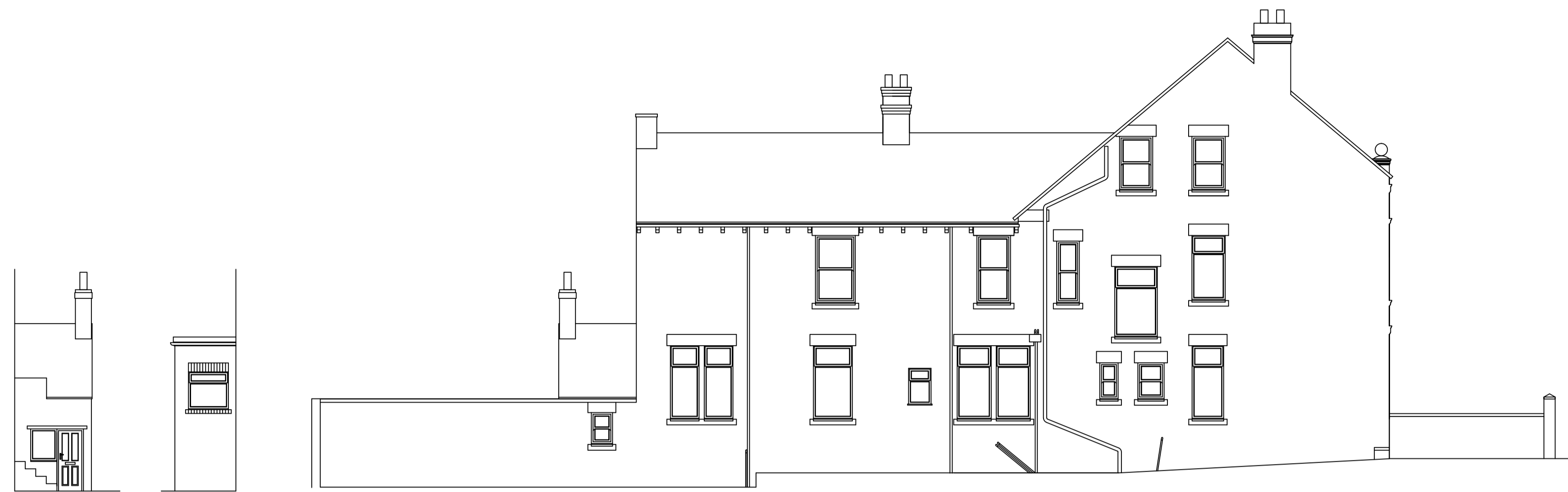
EXISTING WEST ELEVATIONS