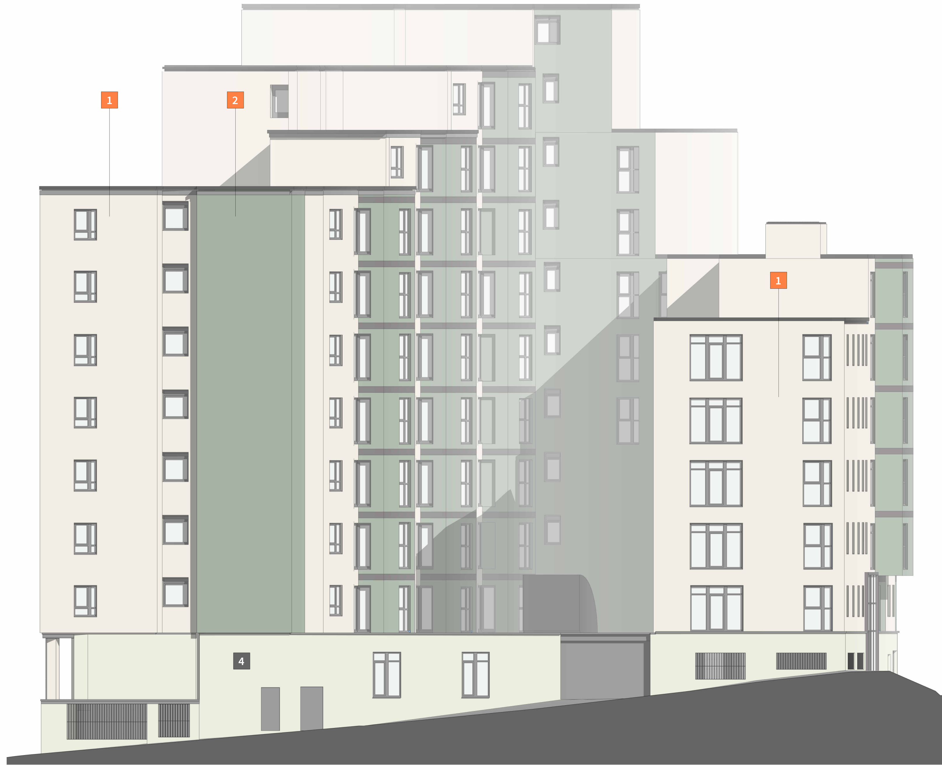
1 Proposed_Elevation - John-St 1:100

NB: REFER TO DRAWINGS, 23-021_FA-DR-200 AND 23-021_FA-DR-201 FOR FURTHER REFERENCE TO EXISTING AND PROPOSED ELEVATION DETAILS.