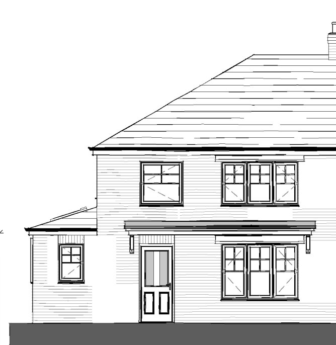
Proposed Front Elevation. 1 : 100