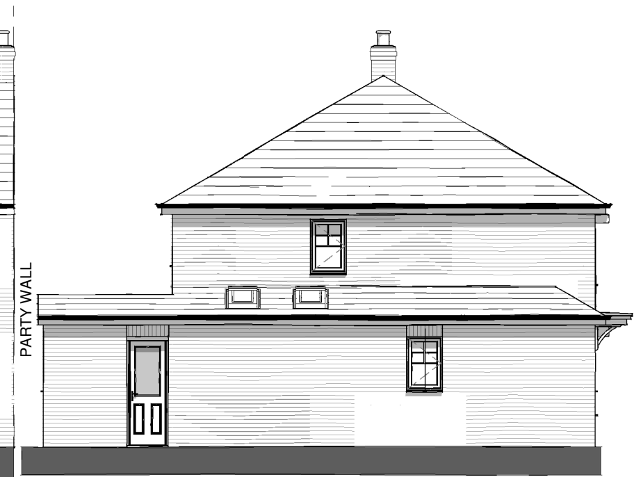
Proposed Left Side Elevation. 1 : 100