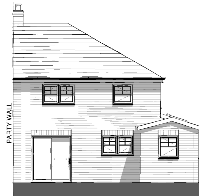
Proposed Rear Elevation. 1 : 100