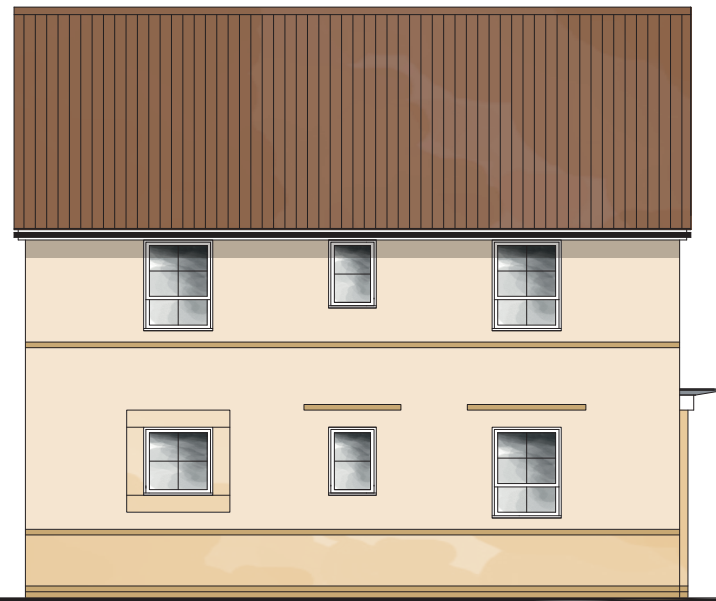
FRONT ELEVATION 2