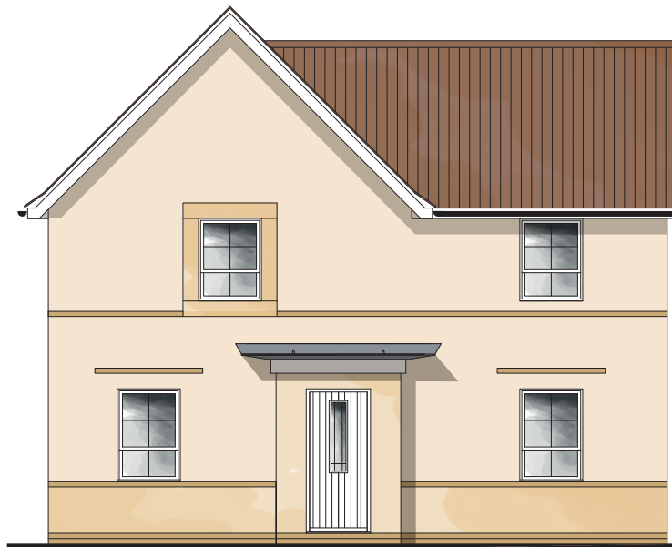
FRONT ELEVATION 1