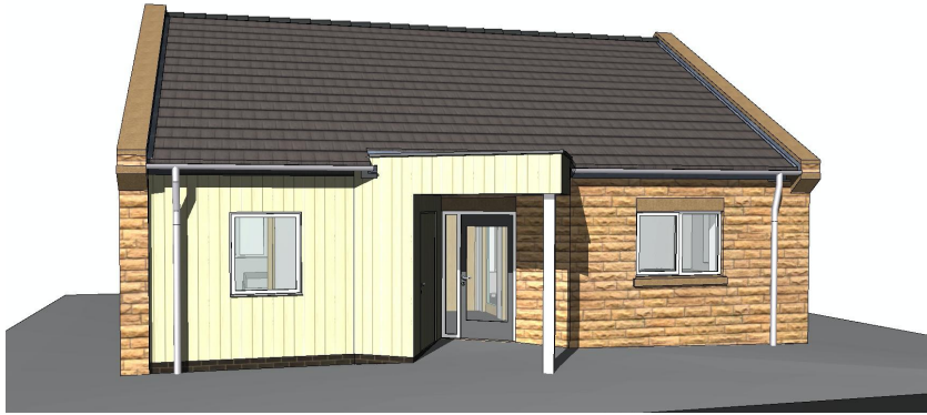
Bungalow Type 2B - Perspective View