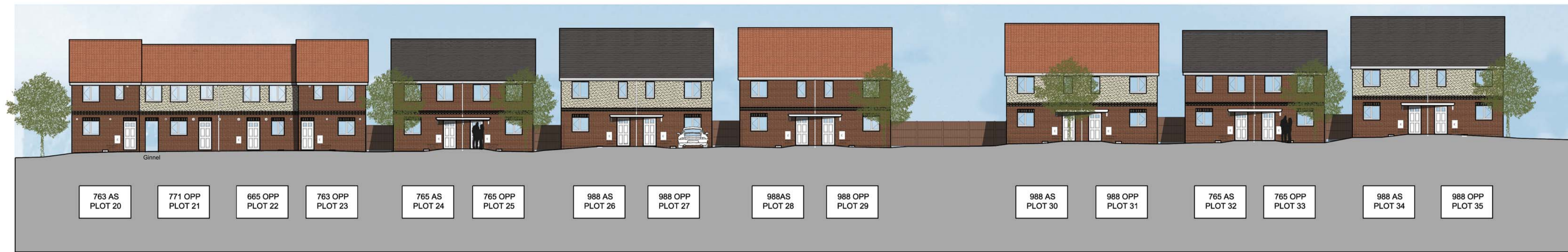
SITE SECTION SITE LOOKING EAST TOWARDS PLOTS 20 - 35. Scale 1:200