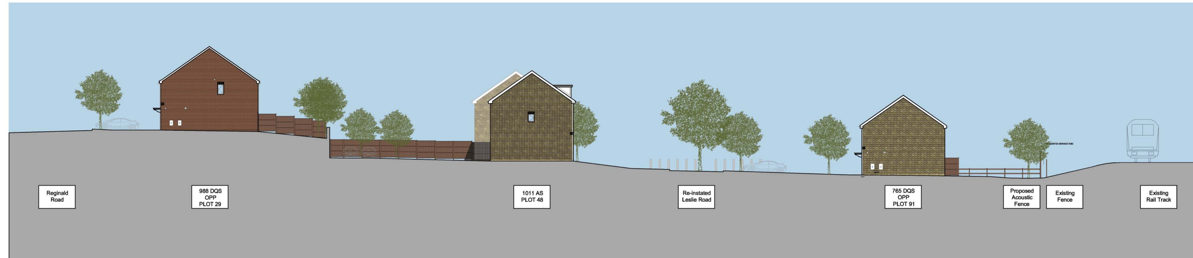
SITE SECTION B-B SITE LOOKING NORTH TOWARDS PLOTS 29, 48 & 91. Scale 1:200