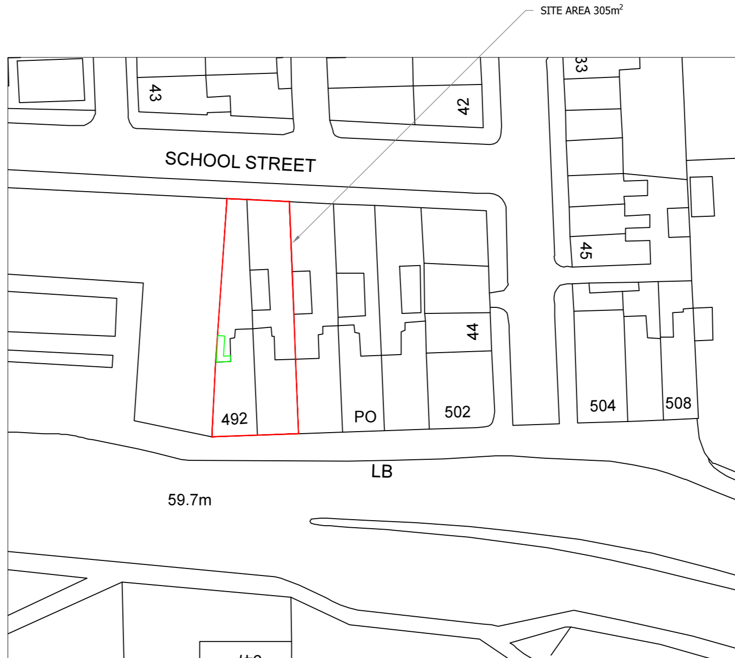
SITE PLAN SCALE 1:500 AT A3