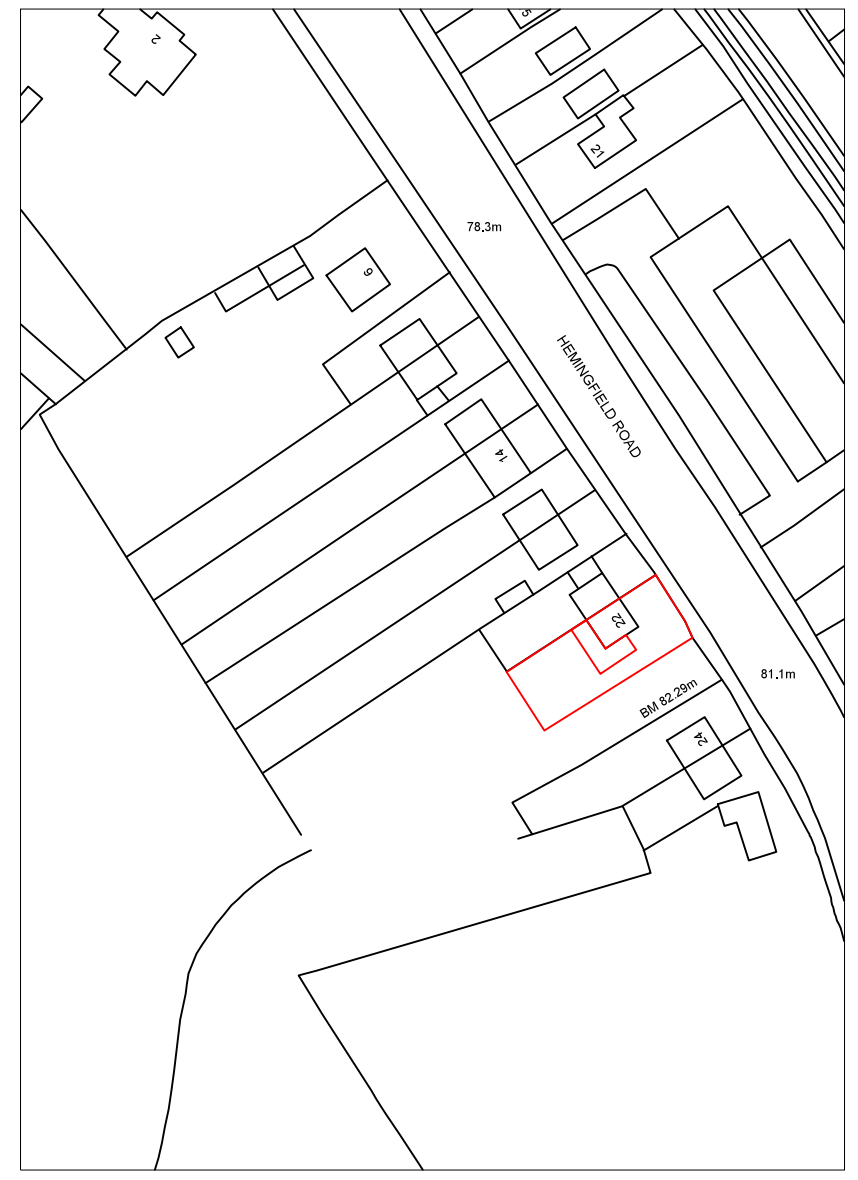
LOCATION PLAN SCALE 1:1250 AT A3