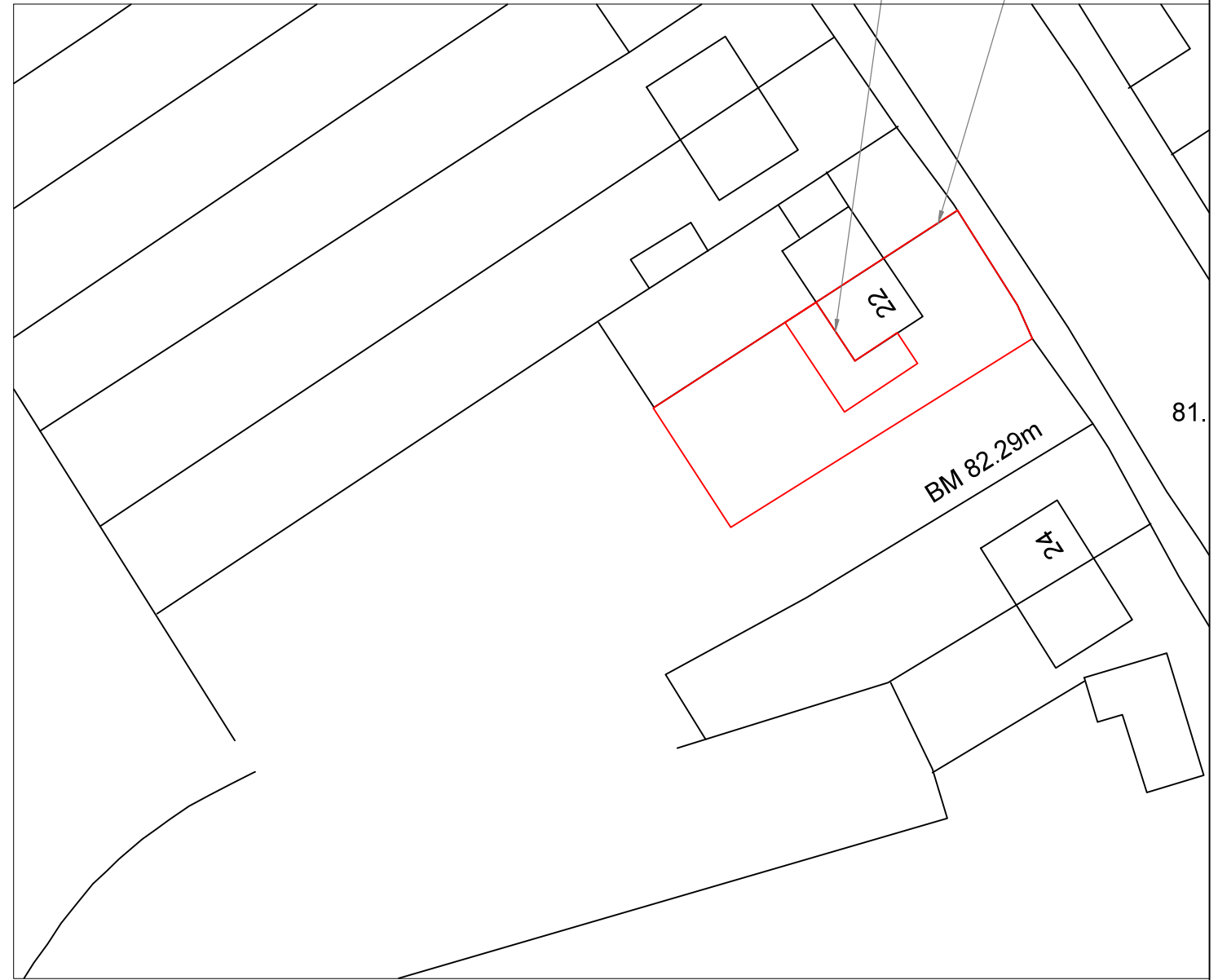
SITE PLAN SCALE 1:500 AT A3