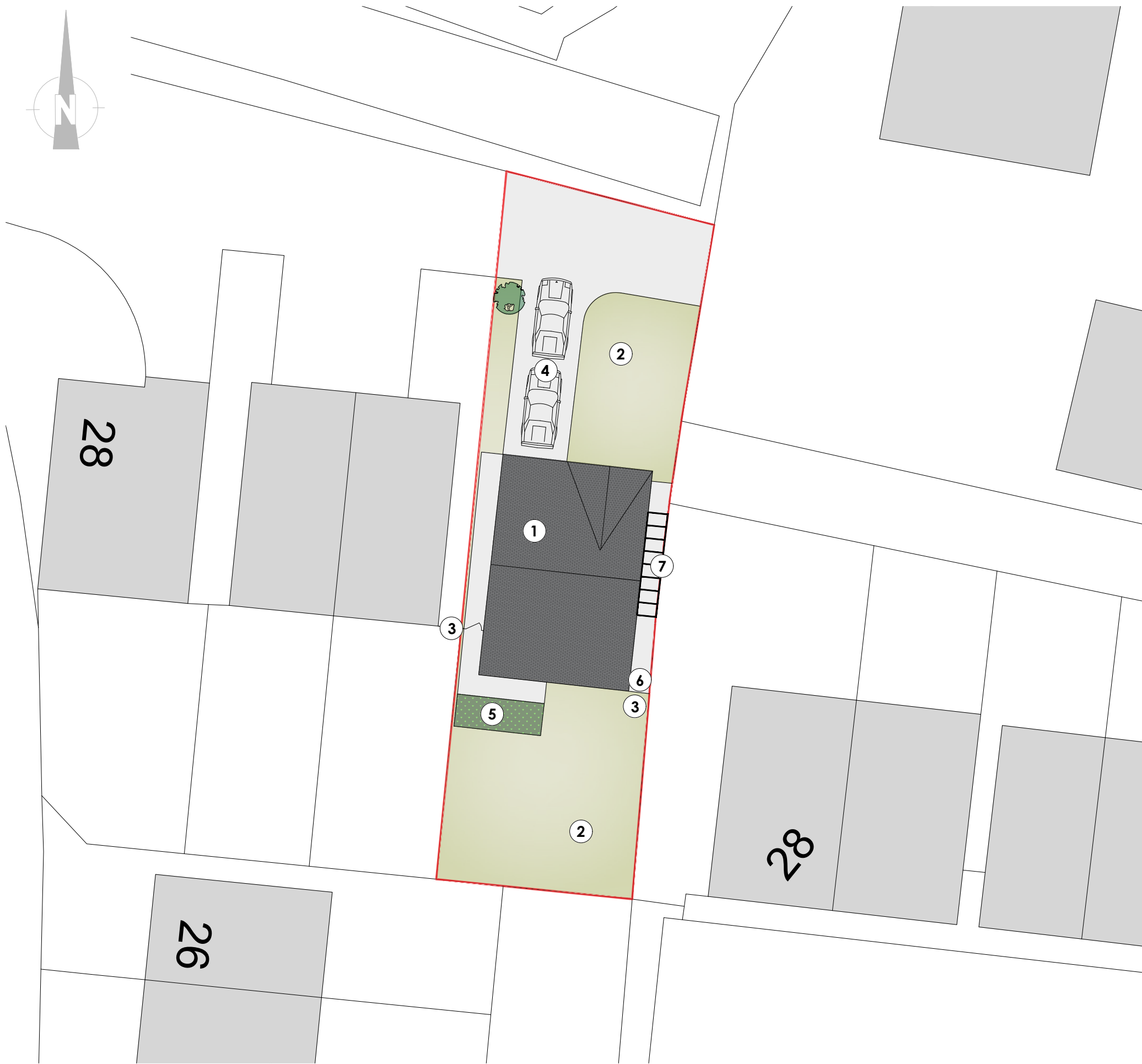
Existing Site Plan Scale - 1:200