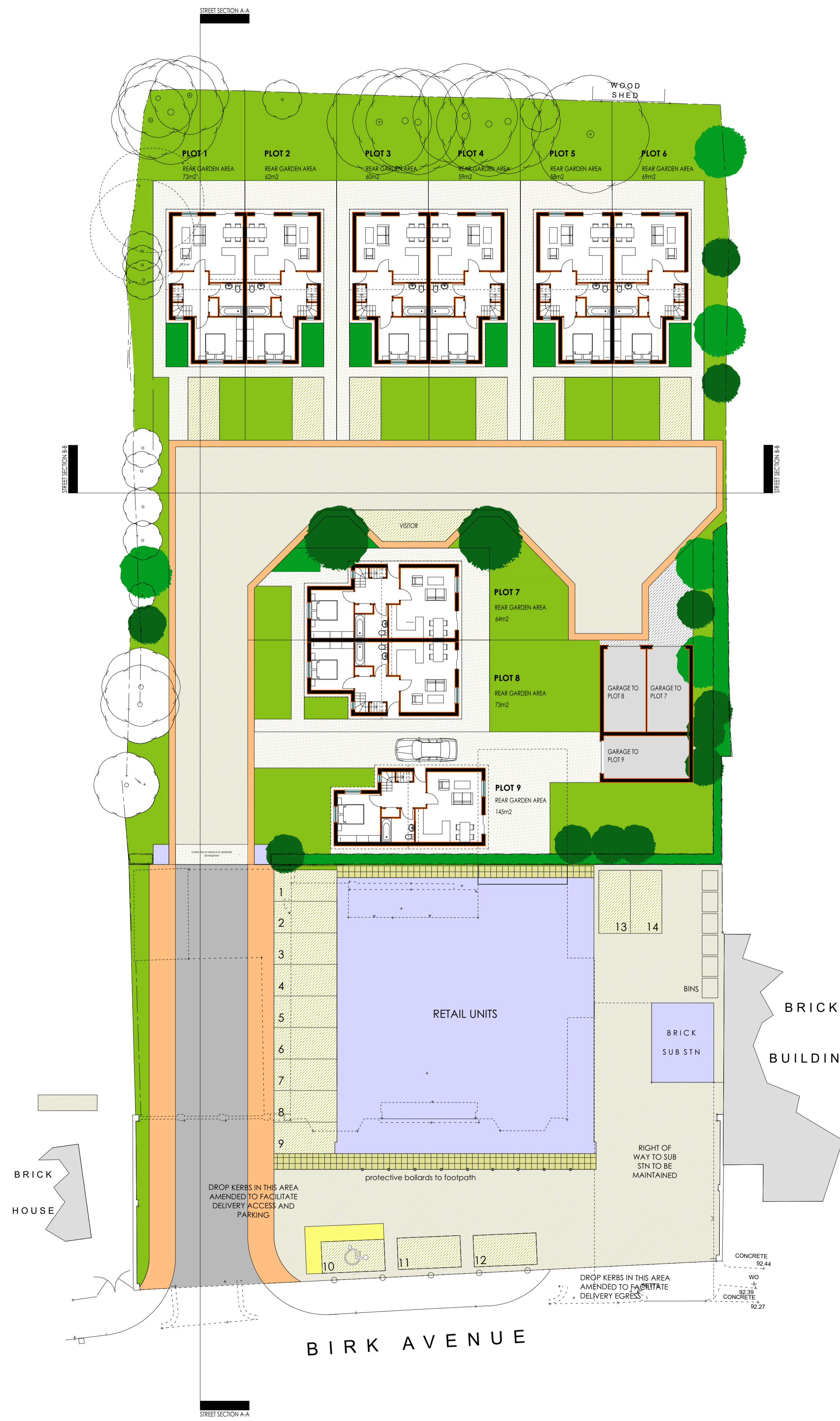
1:200 Site Plan as Proposed