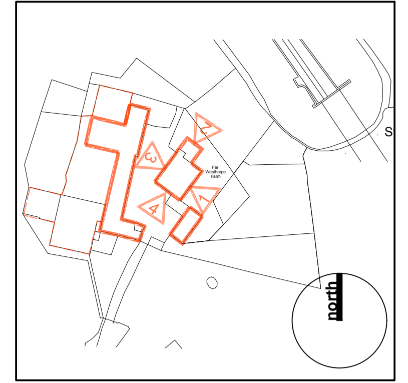
Key Plan 1:1250