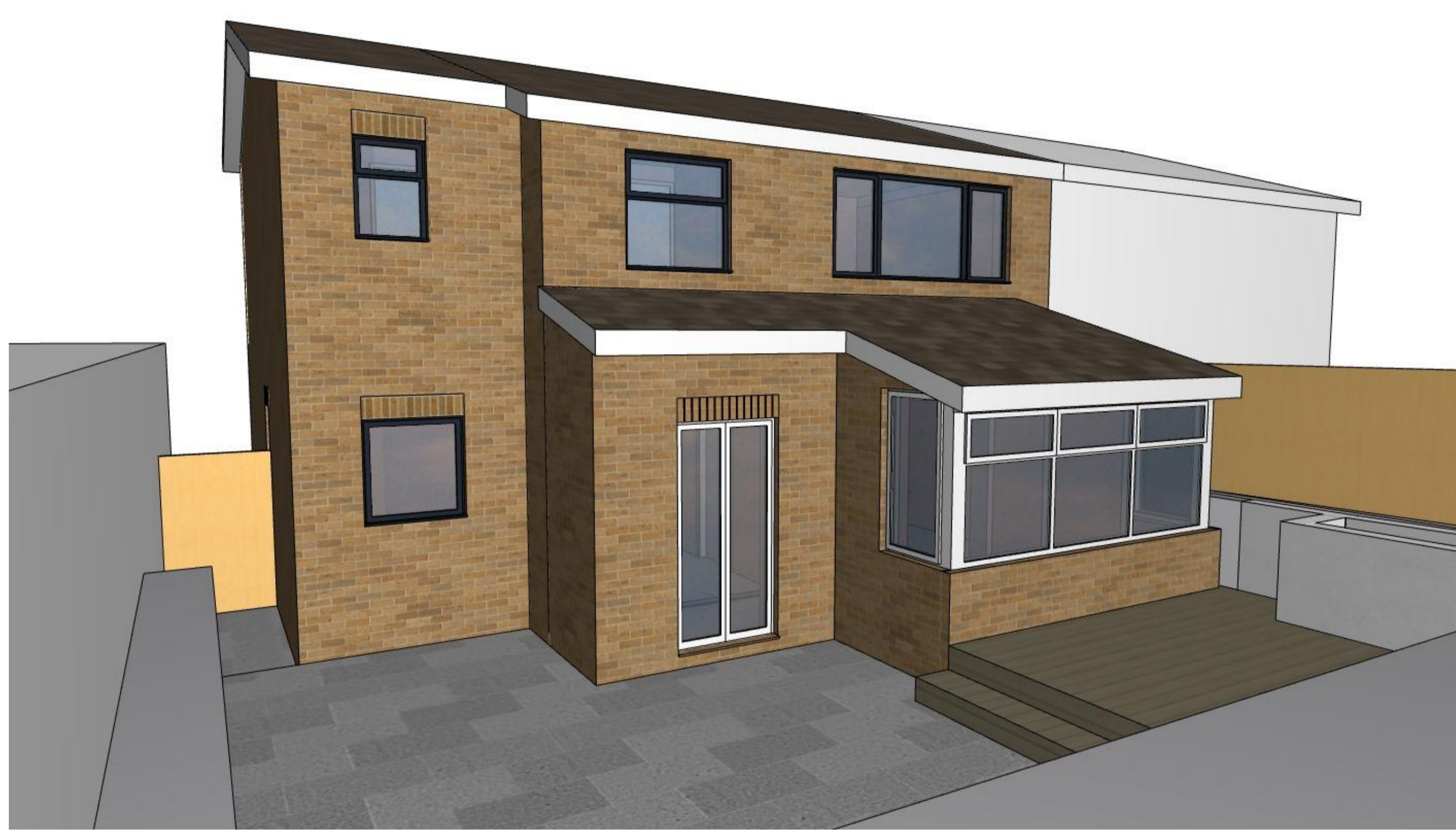
Existing View 1

NOTE Drawing use for status issued for only. Feasibility & Planning drawings are not intended for construction or manufacture. J Mahoney Architects Ltd cannot accept any responsibility for issues arising due to this. All dimensions to be checked on site and any discrepancies to be notified prior to the commencement of work. Do not scale from this drawing. If in doubt ask © J Mahoney Architects