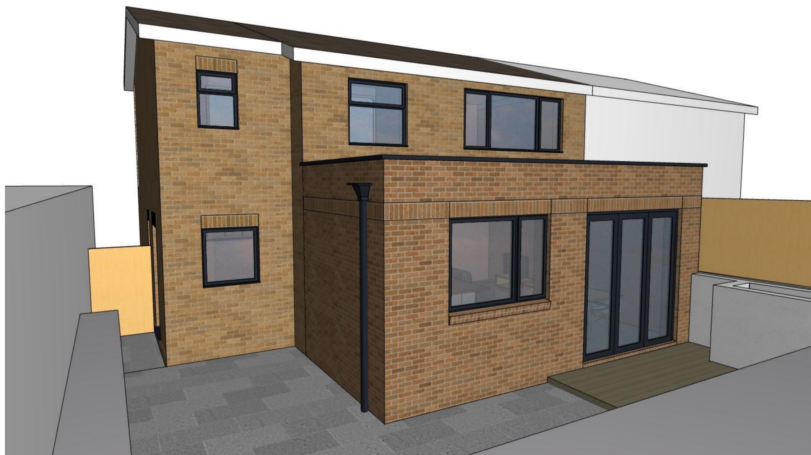
Proposed View 1