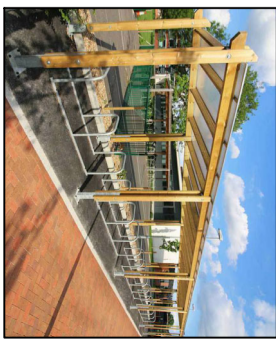
Langley Design Sheldon bicycle shelter with space for 6No. bikes.