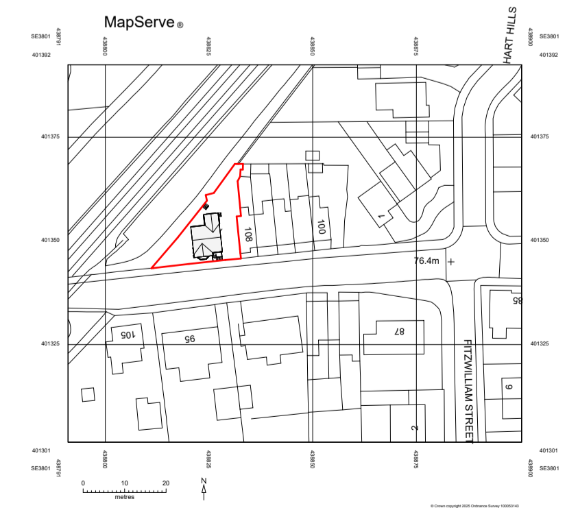
Location Plan Scale: 1:1250